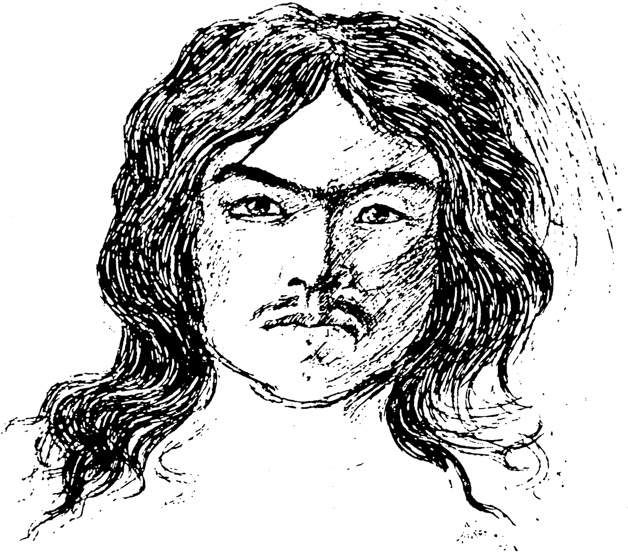
Figure 1. Sketch of the head Harry Love brought back to Sacramento from Cantua Canyon, claiming it to be Joaquin "Muriatta's." The sketch is said to have been drawn directly from the exhibit; the artist is unknown.