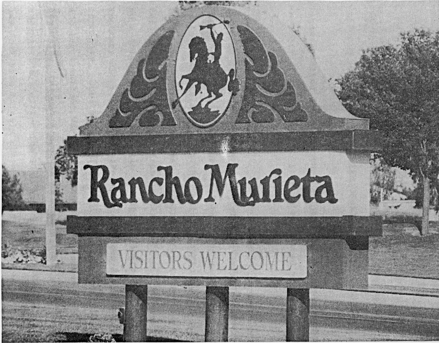
Figure 3. "Rancho Murieta," outside Sacramento, California.