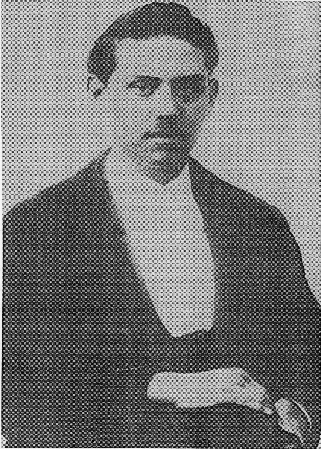
Figure 2. Purported daguerreotype of Joaquin Murieta, said to have been given by Joaquin himself to Calaveras County Sheriff B. F. Marshall in 1850.