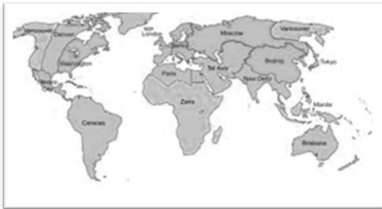
Figure 1.3 Successful globalization.

Sapienza (2001) notices the “juxtaposition and mixing of local and global” elements in the immigrant websites and he calls this “translocal communication” (p. 435). Hoft (1999) suggests combining globalization and localization together by a third choice – collaboration. Turner and Khondker (2010) use Robertson’s words -- “glocalization” to refer to the fusion of globalization and localization. Turner and Khondker (2010) point out that globalization should be considered at two levels – concrete and abstract. The concrete means “material” or “technologies, social institutions, economic processes and the movement of people” while abstract on the other hand, means “non-material,” or “awareness, ideas, ideologies and norms” (p. 36). I will use Figure 1.3 , adapted from Wiki (2013), and Figure 1.4 , retrieved from Wiki (2013), to explain the concrete and abstract level of globalization.