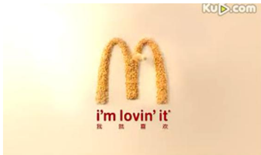
Figure 4.5 McDonald logo and slogan in the "Growth of Chicks" ad.

At the end of the commercial, one of the chicks continue walking into the big M – the symbol of McDonald's as in the above Figure 4.5 (McDonald's, 2011a). Since it has been accused for using the accelerating maturity chicks as its food material in China, McDonald's uses this commercial to tell the consumers that