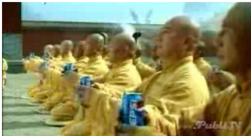
Figure 4.26 Monks in Pepsi's "Pepsi and Monks" ad.

finally comes to the time for his final exam through which he can get recognition by the peer. In the exam, the young man satisfactorily finishes all test sections and at the end of the exam he is given a can of Pepsi. Each monk surrounding him raises a can of Pepsi and looks at him as shown in Figure 4.26 (PepsiCo, 2007). This is a gesture for inviting people to take action in traditional China, especially for people practicing Gong Fu. The young man looks around and looks at his master. He suddenly finds that the tattoo on his master's forehead is similar to the pull tab of Pepsi. So he strikes his head towards the Pepsi (striking head towards something hard to break the stuff is a routine practice in Gong Fu). His master looks at this and nods his head and then all people stand up to congratulate his pass of the exam. At the end of the commercial, the image of Pepsi and the phrase "ask for more" appear on the screen.