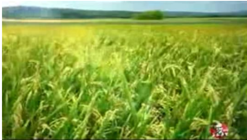
Figure 4.11 The rice field from KFC “Rice Bowl” ad.

the meaning of the words. Often times, commercials use pictures to suggest the audience the quality of their product. For example, see Figure 4.11 (KFC, 2013b) in the following: