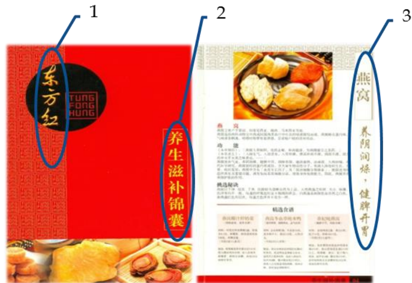
Figure 3.10 Sample pages from the DFH brochure (See DFH n.d.).

imitating the tradition helps to promote the status of the company and gain more consumers' trust.