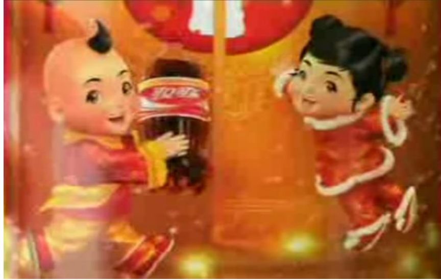
Figure 4.2 Fu Wa from Coco-Cola ad.