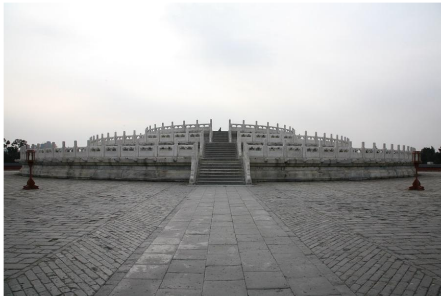
Figure 2.2 The Temple of Heaven.