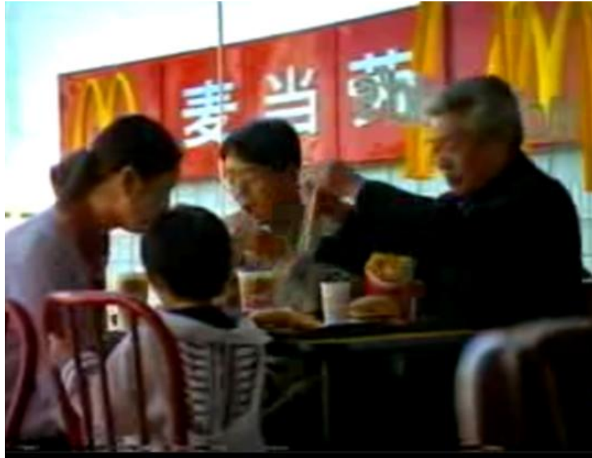
Figure 4.8 Family dining from McDonald's "Good Times" ad.

Figure 4.8 (McDonald's, 2011b) is also from McDonald's "Good Times" commercial, showing the three generations enjoy the meal at McDonald's together.