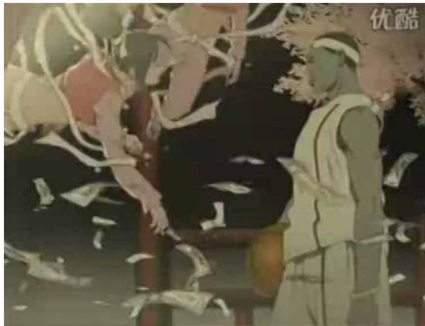
Figure 4.12 Fairies from DunHuang in Nike ad.

Some commercials have used some Chinese images but have not used them correctly. For example, in Nike's fighting chamber commercial in China, the fairy images from Dunhuang Murals - a famous sacred historic site, are used as prostitutes to seduce the basketball player. See Figure 4.12 (Nike, 2007).