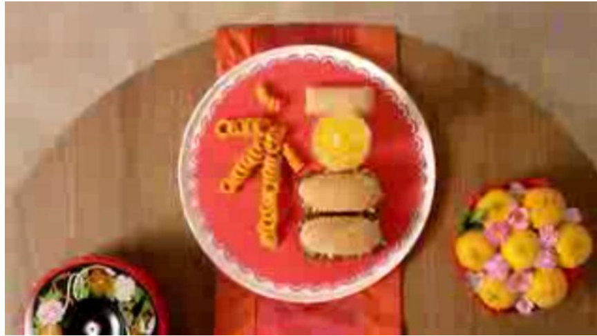
Figure 4.10 Fu (Good Luck) made with McDonald's burgers.

Figure 4.10 (McDonald's, 2012) is a picture from McDonald's Chinese New Year dragon dances commercial.