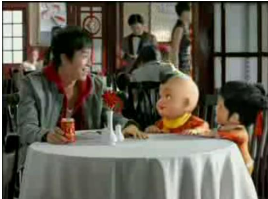
Figure 4.3 Coca-Cola's Bring Me Home ad.

The above Figure 4.3 (Coca-Cola, 2007) shows that the change of the mood of the athlete: he was upset before but he became happy when he saw Fu Wa.