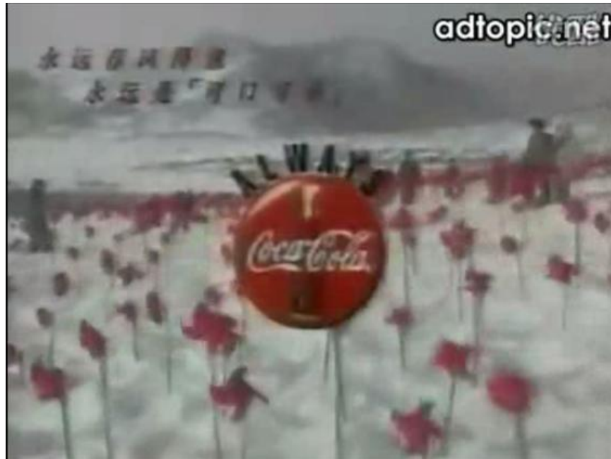
Figure 4.16 Image from Coca-Cola “Windmill” ad.

Figure 4.16 (Coca-Cola, 1997) can be seen as a traditional Chinese painting with the brand name of Coca-Cola. This is a very early commercial of Coca-Cola in China and it helps to start the Coca-Cola’s dominance of the Chinese soft drink market.