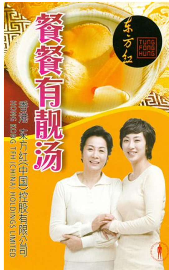
Figure 3.9 Cover page for soup recipes from DFH (See DFH n.d.).

point of view women are not supposed to look very strong as the woman shown in Figure 3.8 .