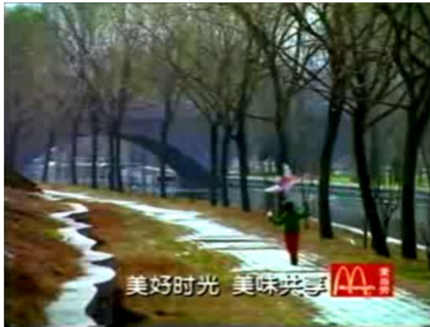
Figure 4.18 Image from McDonald's "Good Times" ad.

places are said to have good Feng Shui. People try to find such places and keep them for their future generations to get good luck and protection from the gods. In the study of Feng Shui, numbers are coated with myth and magic as I have demonstrated of the usage of nine for the Temple of Heaven in the literature review. According to the study of Feng Shui, mountains are regarded as yang and water is regarded as yin. The south of mountain is yang; the north of mountain is yin; the north of water is yang; the south of water is yin. A good place for a house should with the back towards mountain and facing water, besides, it should with back towards north and facing south to have enough sunshine (Hao & Yang, 2010, p. 24).