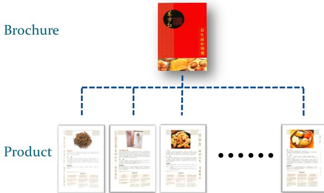
Figure 3.3 Analysis of the structure of DFH brochure.

its products in a holistic way, which is greatly influenced by the different philosophical thoughts and I will discuss in detail later in this chapter.