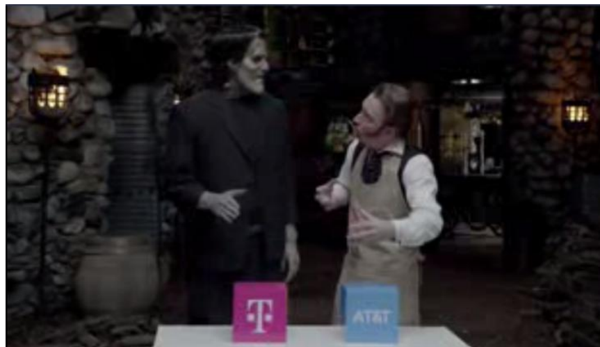
Figure 4.23 Image from T-Mobile's "The Simple Choice" ad.

In another commercial, a monster picks "The Simple Choice". The symbols of T-Mobile and AT&T are compared to each other as well. See Figure 4.23 (T-Mobile, 2013).