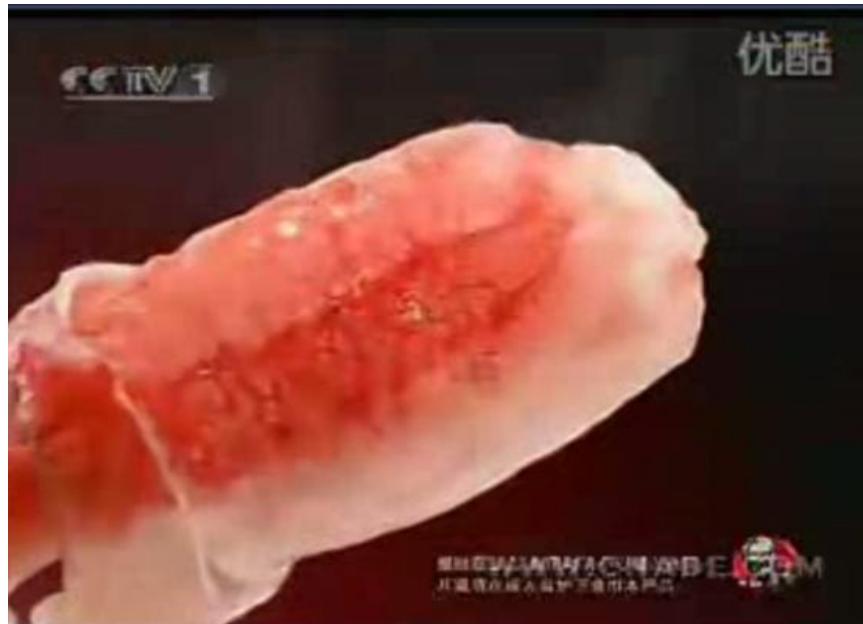
Figure 4.19 Close-up of a crab leg from KFC ad.

KFC is an expert in glocalizing its food in China. See Figure 4.19 (KFC, 2009) from its golden crab legs commercial.