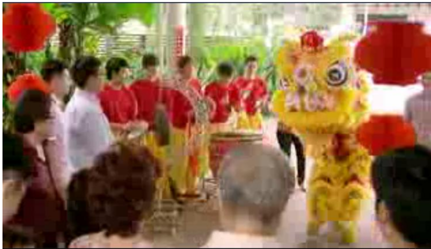
Figure 4.14 Dragon dance from McDonald's ad.

There are many commercials that use the Chinese images appropriately and impress the audience greatly. For example, McDonald's dragon dances commercial uses the dragon dance – a typical traditional Chinese activity to celebrate some good big events or holidays to tactically connect the brand of McDonald's with the Chinese living as shown in Figure 4.14 (McDonald's, 2012).