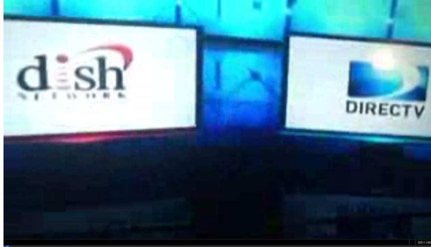
Figure 4.24 Image from Dish Vs. Direct TV ad.

Comparison of product is widely used in western TV commercials because people like to use the information from comparison to make what they consider the logical choice. Knowing this mode of reasoning, the companies try to provide information that leads the consumer to draw favorable conclusions as they compare the products.