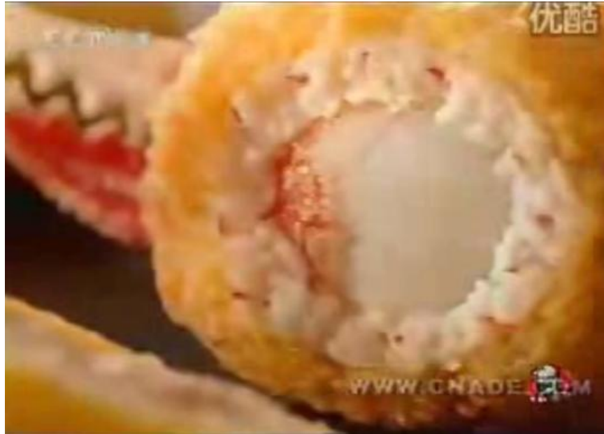
Figure 4.20 Golden, deep fried crab leg from KFC ad.

instead of taking the meat out of the shell, KFC keeps the shell on the tongs and just fries the meat wrapped with flour. See Figure 4.20 (KFC, 2009).