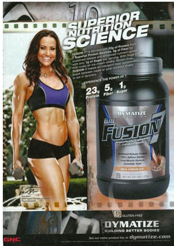
Figure 3.8 A flyer for Fusion from GNC (See GNC n.d.a).

The pictures used by the GNC and DFH brochures reveal a lot of culture related information.