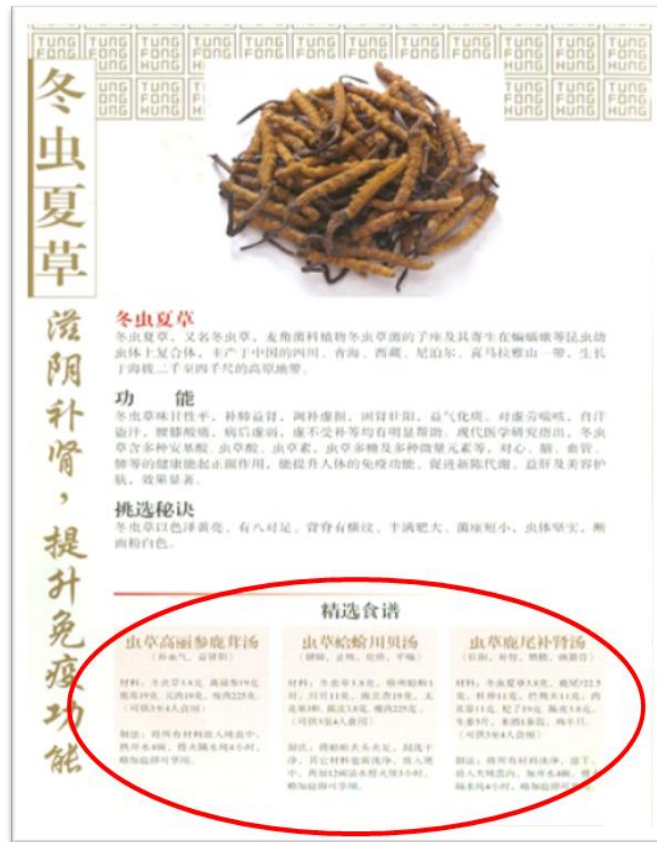
Figure 3.7 Introductory Page of Cordyceps from DFH Brochure (See DFH n.d.).

restaurants in China too. So the nutrition products are regarded as healthy food rather than as medicine in China.