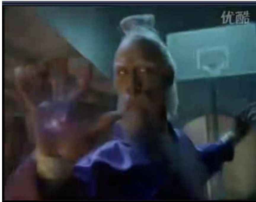
Figure 4.25 Zhou Gong in Nike's "Fighting Chamber" ad.

Since Ren is such an important virtue that the Chinese respect, the behavior that contradicts with Ren will be offensive to the Chinese. One of the reasons for the Nike's fighting chamber commercial in China being banned is that it defiles and demonizes the image of Zhou Gong who is the very founder of the ritual system as well as the founder of the importance of humane virtue. See Figure 4.25 (Nike, 2007).