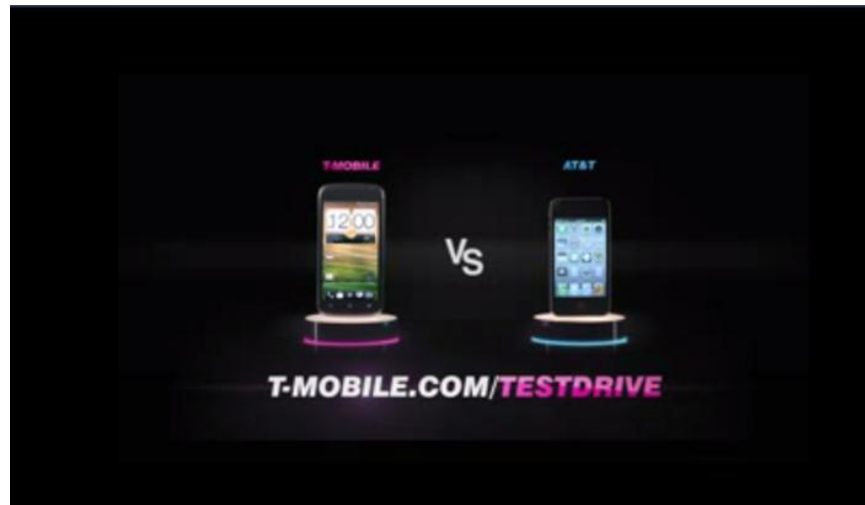
Figure 4.22 Image from T-Mobile's "See It Again" ad.

In another commercial, a monster picks "The Simple Choice". The symbols of T-Mobile and AT&T are compared to each other as well. See Figure 4.23 (T-Mobile, 2013).