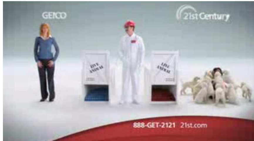
Figure 4.21 Image from 21st Century's "Puppy Love" ad.

21st Century Insurance always compared its price with Geico. For example, in another commercial, "Shopping Carts," it says that "switched from Geico, 21st century saved $508 a year" (21st Century Insurance, 2012b).