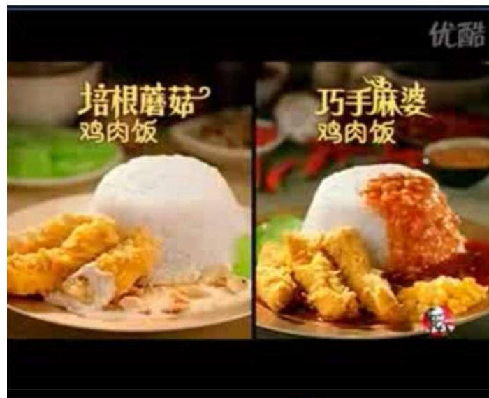
Figure 1.2 Image of rice bowl from KFC ad.

chili sauce resonate with the Chinese taste. According to research, “Asian American consumers are intensely brand loyal” (Mueller, 2008, p. 224). This is also a Chinese characteristic. KFC changes its menu to adapt into the Chinese culture, which makes the Chinese people gradually accept this brand and become loyal consumers. For example, schools and companies order this meal for group dining, providing a large consumer base for KFC.