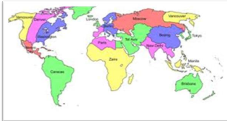
Figure 1.4 Demonstrated need for localization.

Figure 1.3 shows that the concrete level of globalization is easier to achieve. The same color all over the map means globalization makes the same products available everywhere in the world. Figure 1.4 is a map with various colors which means the abstract level is very hard to be globalized. The abstract level refers to the philosophical values which have been built into people's minds through long time cultivation. It is the social cultural norms pass through generations. Since it is either impossible or it would take years, decades or even over the centuries to globalize the abstract level, while on the other hand, it is not very difficult to globalize the concrete level, I would advocate the method of glocalization: globalize the concrete level but localize the abstract level. Glocalization means people all over the world will have something in common but each of the different groups sustains its own features.