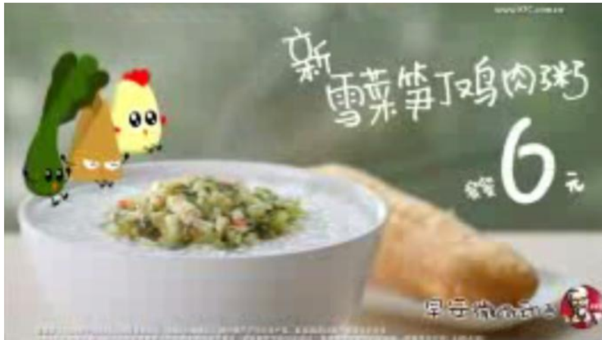
Figure 1.1 Image of potherb mustard porridge from KFC ad.

Figure 1.1 (KFC, 2013a) is a typical Chinese style breakfast: porridge with brined vegetables (potherb mustard) and twisted cruller. This is a popular breakfast in the Chinese KFC restaurants, not available in the typical American KFC.