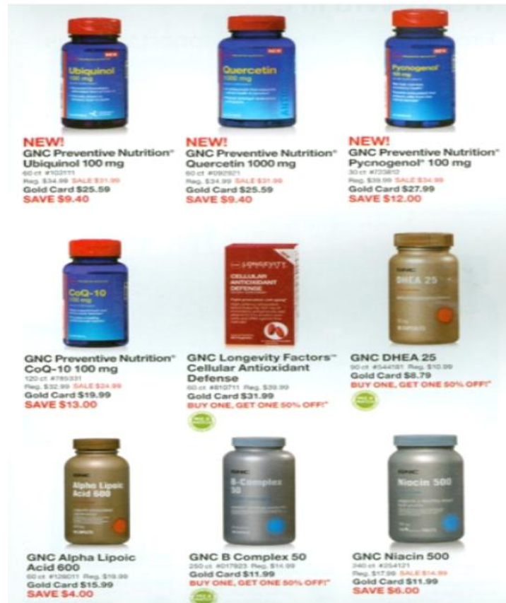
Figure 3.6 A demonstration page of GNC products (See GNC n.d. a ).

Figure 3.6 shows bottles with different labels telling the products' names and chemical components. Let's compare it with the product introduction from DFH as in Figure 3.7.