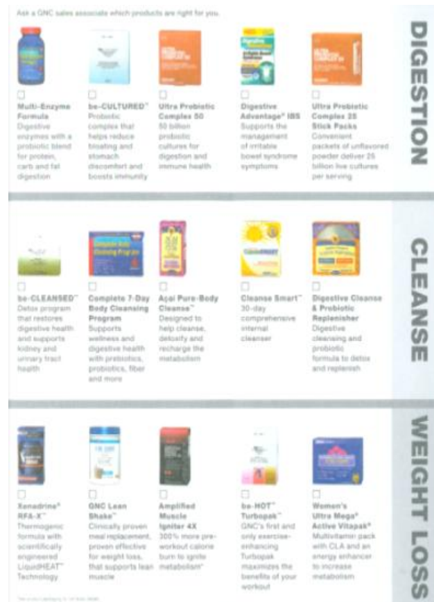
Figure 3.2 An example of pigeonholing of GNC products (See GNC n.d. a ).

symptoms, the Chinese nutrition focuses on the cause – the function of the lung. When the lung functions well, all problems will be solved, so there is no need to tackle the problems one by one.