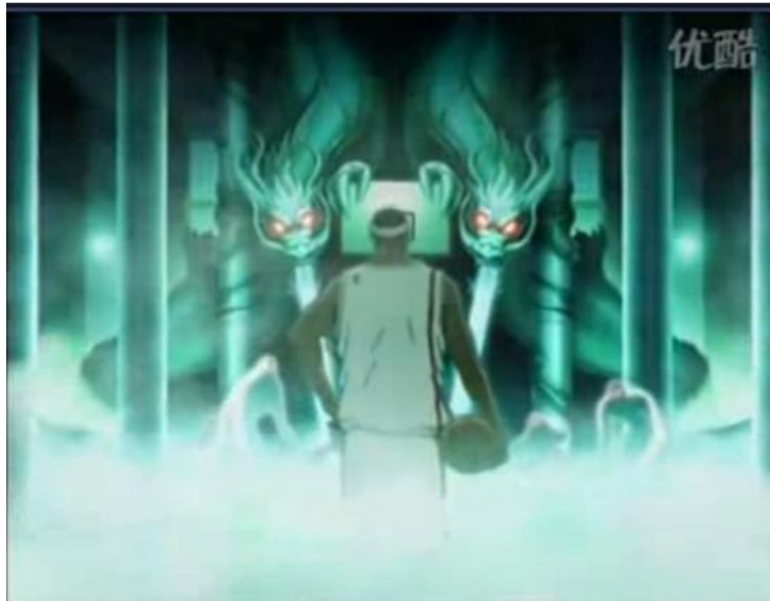
Figure 4.13 Dragon in Nike ad.

Also, in this commercial, the dragon, which is well-known as the totem of Chinese, becomes the evil enemy which is beaten down by the player in the commercial, as shown in Figure 4.13 (Nike, 2007).