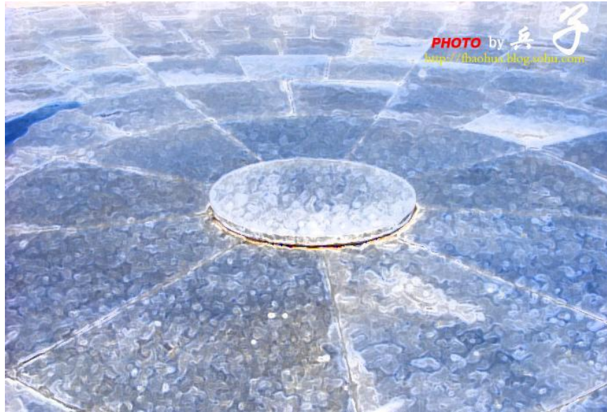
Figure 2.1 Circular mound of the Temple of Heaven.

Figure 2.2 (The Temple of Heaven, 2013) shows, each level of stairs towards the top of the Temple includes nine steps.