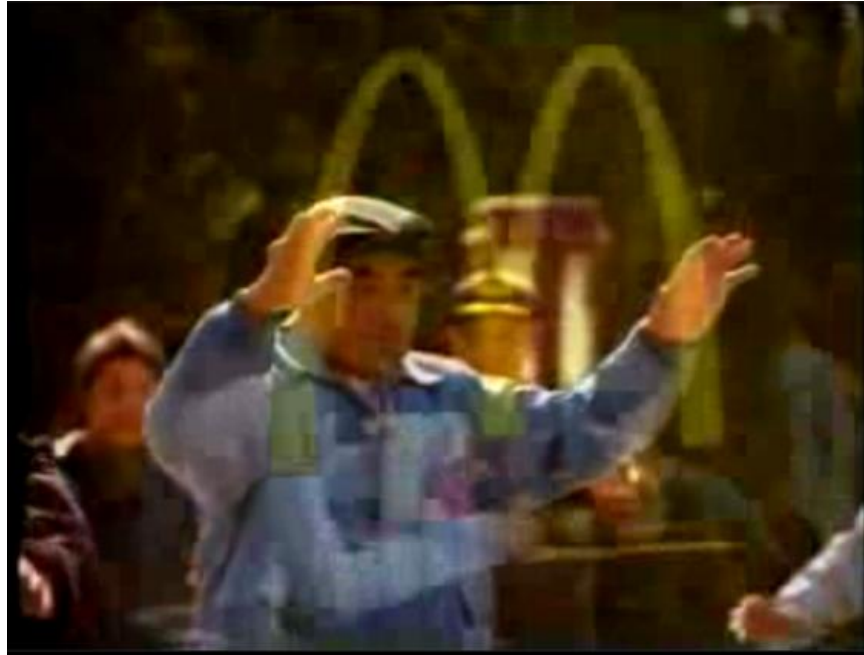
Figure 4.7 People practice TaiJi from McDonald's "Good Times" ad.

Figure 4.7 (McDonald's, 2011b) is featuring an old man practicing TaiJiQuan. His movement of the arms looks like the Big M image of McDonald's. When talking about family, the Chinese will think about the extended family which includes not only parents and children, but also grand-parents, great grand-parents, uncles, aunts and cousins. "With a greater frequency than many other immigrant groups, Asian Pacific immigrants to the United States – most especially, recent immigrants – invite members of such extended families to visit them in the United States" (Mueller, 2008, p. 2013). For most Asian cultures, family refers to the extended family and the members in the extended family are close.