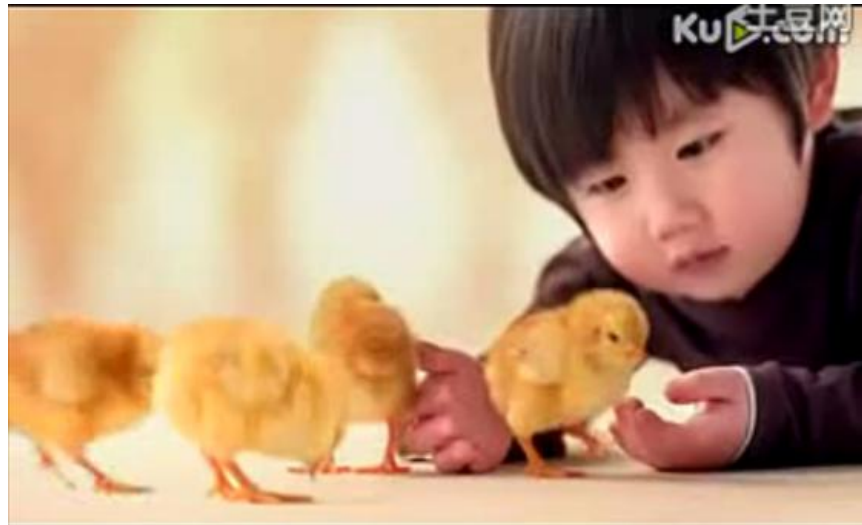
Figure 4.4 McDonald's the "Growth of Chicks" ad.