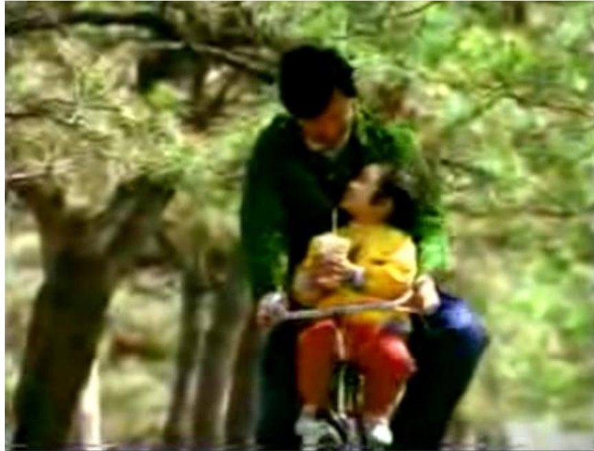
Figure 4.6 Father and daughter from McDonald's "Good Times" ad.

In Figure 4.6 (McDonald's, 2011b), the daughter holds a drink that her father bought her in McDonald's. She looks at and talks to her father and the father looks at his daughter and listens attentively. McDonald's commercial catches this pleasant moment of the family and relates it with its brand.