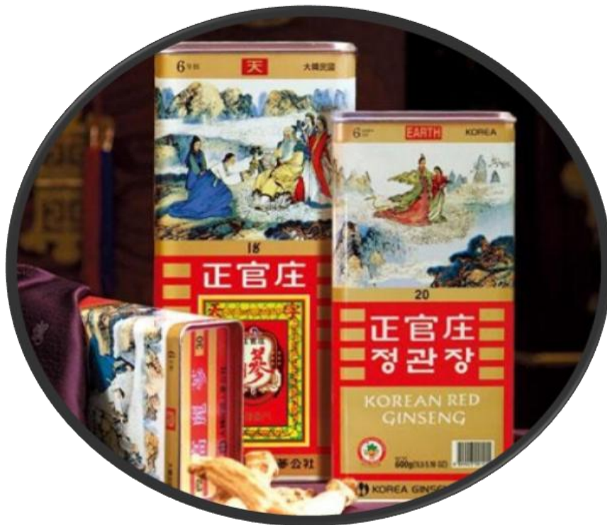
Figure 3.11 Images in the packaging of Korean red ginseng (See KGC n.d.).

Huang (1999) points out: “Ginseng occupies an important role in folk medicine, not only in China, but also in Korea and Japan” (p. 18). Actually, a lot of Asian countries’ medical therapies are influenced by traditional Chinese medication theories, and also by Chinese cultures and philosophies. For example, Figure 3.11 shows the pictures from a ginseng product from Korea.