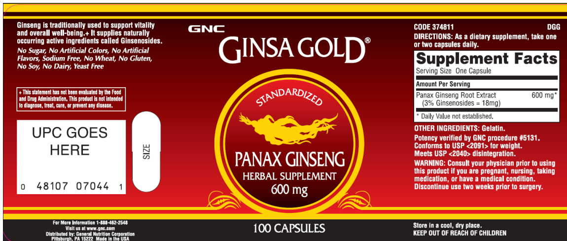
Figure 3.4 Label of GNC Panax ginseng (See GNC n.d. b ).

The supplement facts table itself is a blatant advertisement for the product and it is usually put in a prominent place.