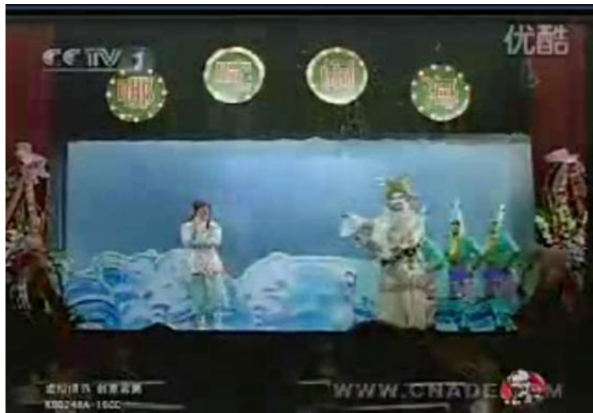
Figure 4.15 Bei Jing Opera performance from KFC ad.

Another good example of using the Chinese image is KFC’s golden crab legs commercial. Beijing Opera is a typical traditional Chinese stage art and it is regarded as the quintessence of China. Many people, especially the older people, love this art. KFC uses the Beijing Opera to introduce its new product to the Chinese consumers. See Figure 4.15 (KFC, 2009).