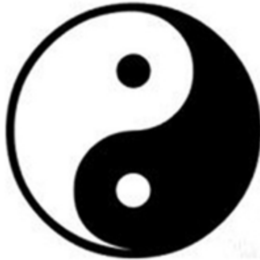
Figure 4.1 Symbol of TaiJi (See Symbol of TaiJi, 2013).

Figure 4.1 shows a circle formed by two fish-like shapes: one represents Yin and the other represents Yang. Figure 4.1 demonstrates that Yin and Yang are closely related and even inter-related with each other: there is a white dot in the black part and there is a black dot in the white part. The dots look like the eyes of the fishes. Figure 4.1 also points out that Yin and Yang are interchangeable: the wider part of Yin or Yang is connected with the narrower part of the other, which means the fullest on Yin is the starting point of Yang and vice versa. The design of the TaiJi is a typical representation of the Chinese philosophical thoughts: everything is inter-related and interchangeable and the extreme is the changing point. Different than the dichotomy method of the western thought, the Chinese focus on relationships between each other. So the circle is not divided by a straight line, which would be two parts that are not related and that they are contrasting and competing with each other. Figure 4.1 shows that between Yin