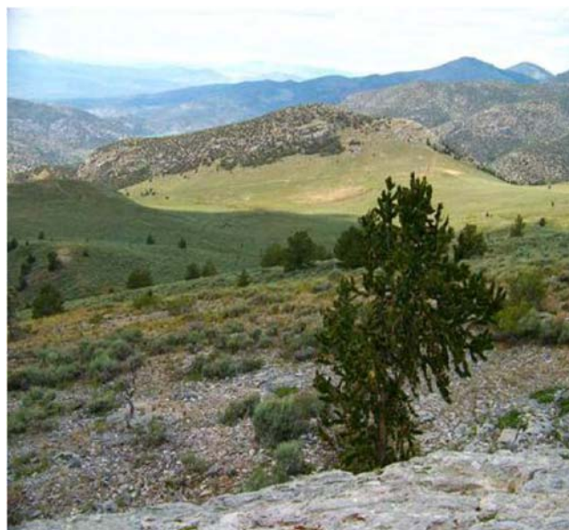
The Great Basin.

The western half of the state is part of the Great Basin, with no outlet to the sea. Most of the water in Utah's portion of the Great Basin flows to the Great Salt Lake. Water evaporates, leaving salts that accumulate over time. The salinity results in unique life forms and mineral deposits. The Bear River is the largest river in the Great Basin with an estimated natural flow of almost 1.2 million acre-feet per year 1 (1 acre foot is the equivalent of water used by a family of 3-4 in one year). The Great Salt Lake also receives water from the Weber and Jordan Rivers as well as smaller tributaries. Enroute to the Great Salt Lake, water for human uses is stored in Utah Lake, Bear Lake, Willard Bay Reservoir, Deer Creek Reservoir, Jordanelle Reservoir, Flaming Gorge Reservoir, and many smaller reservoirs. Not all water in the Great Basin flows to the Great Salt Lake. One example is the Sevier River, which transports water to Yuba Lake and terminates in Sevier Lake.