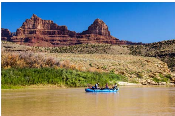
The Colorado River.

Although the Colorado River historically emptied into the Gulf of California (in Mexico), the many demands on this water typically cause the Colorado River to dry before reaching its outlet. Utah is a member of the Colorado River Compact, which dictates 1.37 million acre-feet of the Colorado River per year is used in the state. Utah currently uses about 70% of this allotment. 2