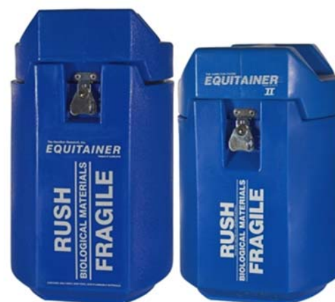
Figure 1. Typical cooled semen transport containers.

In otherwise healthy adult horses, clinical signs of EAV infection may not be evident. When clinical signs do occur, they typically become evident 3 to 7 days post-exposure and may include: fever;