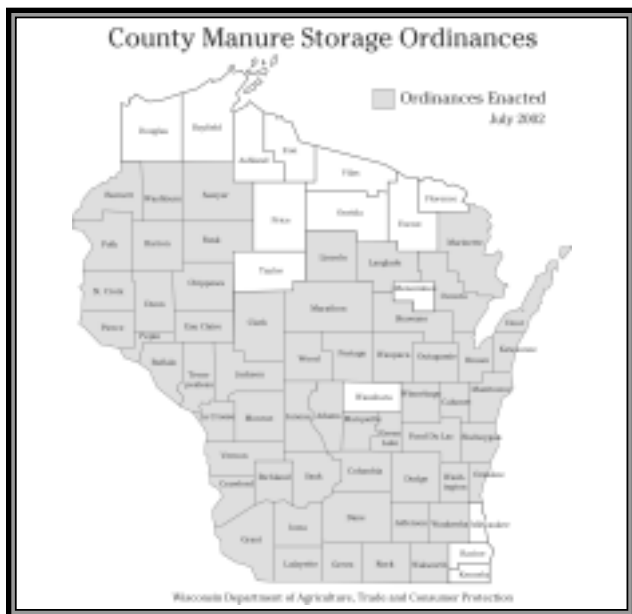
Figure 5.2: Counties with Manure Storage Ordinances in Wisconsin

Under section 92.11, Wis. Stats., counties, cities, villages, and towns may enact ordinances that prohibit land uses and management practices responsible for excessive soil erosion, sedimentation, nonpoint source water pollution or stormwater runoff. Under this broad authority, local governments may regulate most types of farm practices (related or unrelated to livestock production) to protect water quality. Ordinances under this section do not become law unless approved by a referendum. In 1998, the towns in Manitowoc County voted to approve an ordinance under this authority to regulate manure applications and livestock grazing near waterways.