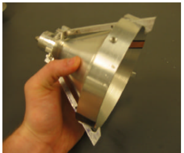
Figure 4. Bandit Dock.

If successful, the Bandit mission would be disruptive by demonstrating that autonomous, image-navigated spacecraft could be produced at a very low cost. On a larger scale, the Bandit mission (and others like it) are disruptive by demonstrating that real spacecraft engineering research can be performed at universities.