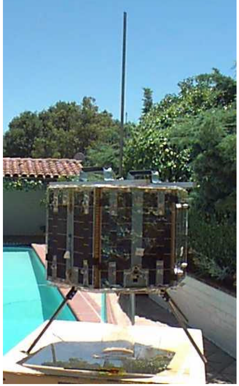
Figure 3. Sapphire.

Sapphire is an example of the traditional universityclass spacecraft, where the primary reason to create the spacecraft was the student training itself. Sapphire's lack of compelling flight mission led to the 3-year delay in securing a launch, and its primary function on-orbit has been as spacecraft operations training tool for students at many universities. While the student training is an important mission, it is not disruptive.