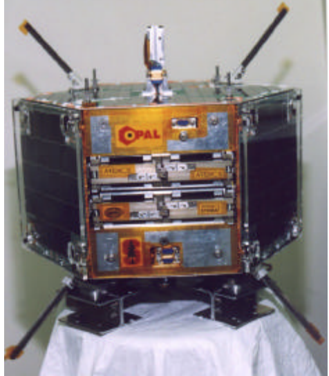
Figure 1. Opal.

The Orbiting Picosatellite Automated Launcher (OPAL, or, as commonly used, Opal) mission began in 1994 at Stanford University, and was launched in January 2000 on a Minotaur rocket as part of the JAWSAT mission.<sup>19</sup> Shown in Figure 1, Opal is a 23 kg hexagonal prism made of aluminum honeycomb carrying COTS electronics. Opal's primary mission was to demonstrate deployable spacecraft technologies; six hockey-puck sized "picosatellites" (PICOSAT 1 & 2, StenSat, Thelma, Louise, JAK) were deployed from Opal several days after launch. In addition to its primary mission, Opal conducted magnetometer hardware testing and acted as an Amateur radio repeater.