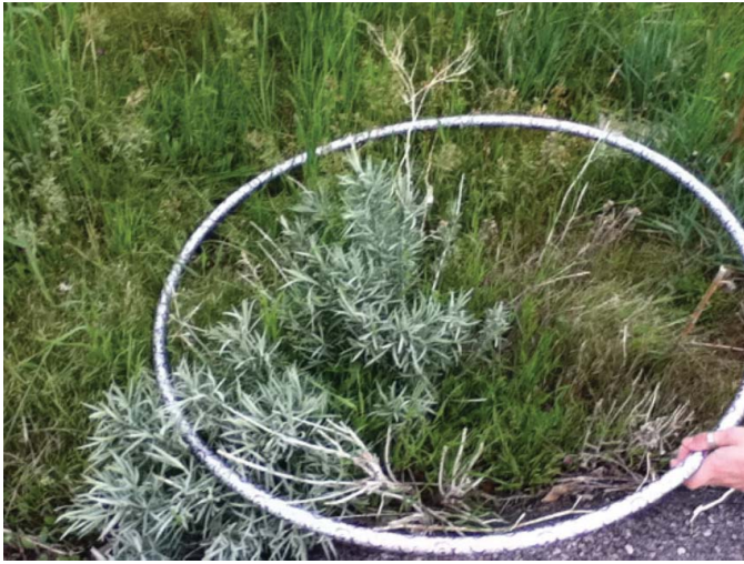
FIGURE 2 Hoop used for sampling (color figure available online).

the cup inside the hole, and pouring soapy water inside the cup. The pit traps are left as an optional focus for later inquiries in Days 3 to 10. ( Safety Precautions: The teacher should examine the potential areas that will be visited beforehand to identify any poisonous plants and insects that may be problematic and either avoid areas with such concerns or share these concerns and strategies for avoiding them with students.)