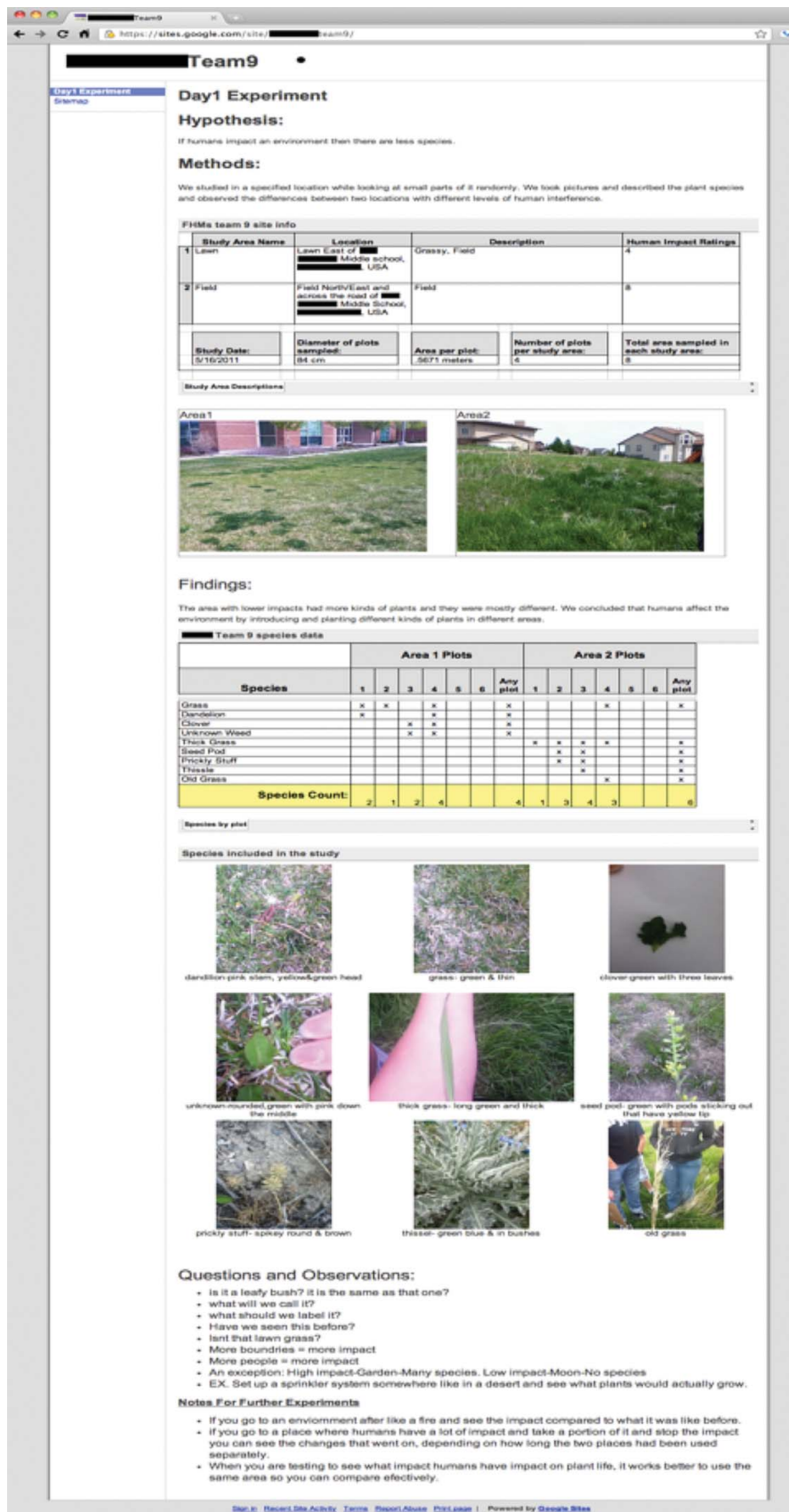
FIGURE 3 Example Web page screen (color figure available online).