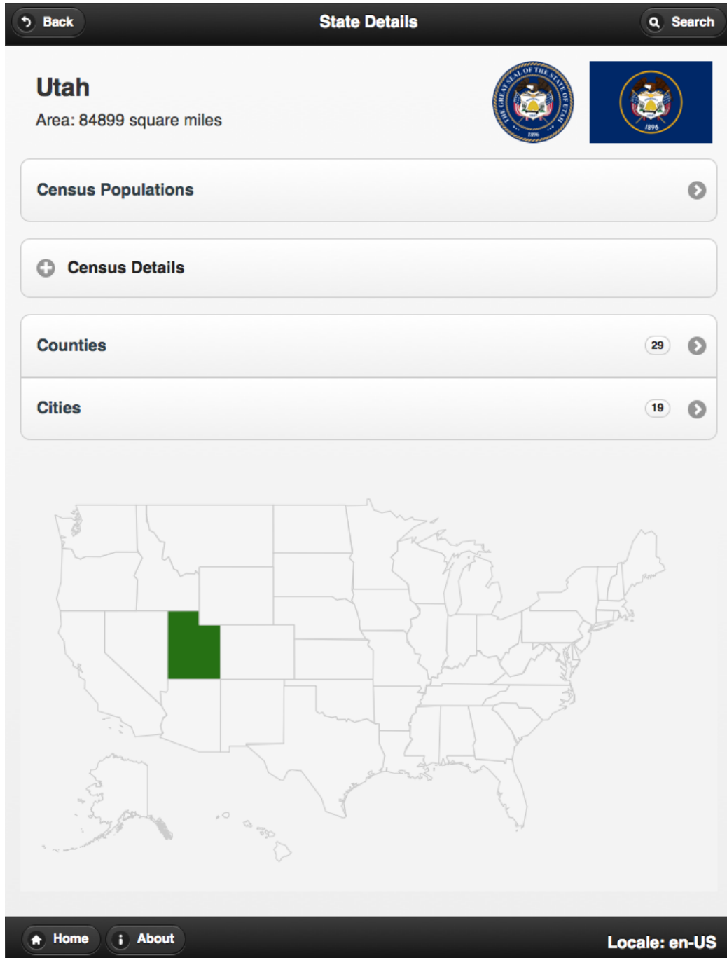
Figure 3.1: Sample rich web application screenshot.