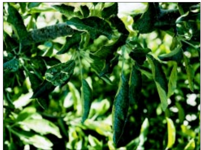
Feeding on leaves causes white speckling or mottling. Leaves with heavy infestation become almost completely white.

The white apple leafhopper is the most common and serious of the leafhoppers found on apple. The rose leafhopper is also found on apple and pear in the Northwest. The two leafhopper species are similar in appearance, feeding habits, and life cycle and occur as mixed populations or individually in orchards. White apple leafhopper is native to North America and appears throughout fruit growing regions of the United States and Canada. It is primarily an economically important pest of apple. There are two generations of white apple leafhopper per year in Utah.