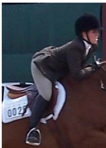
Two point position

The jumper course, unlike the hunter course, requires sharp turns, combinations and multiple changes of direction. Due to the greater degree of difficulty, more agility and athleticism are required from the horse and rider. The difficulty of the course and obstacles should be in direct relationship to the level of the competition. Each course will include 6 to 10 jumping efforts. The judge will blow a whistle to indicate the rider can begin the course. The exhibitor must salute the judge and be acknowledged before crossing the start line.