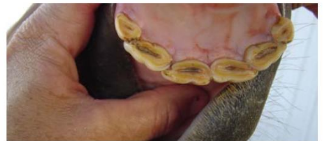
Figure 7a. Young horse's mouth with cups and rectangular table or grinding surface.

The shape of the grinding surface, amount of tooth seen below the gum line, and angle of the teeth change with age. A horse under 9 years of age will have a rectangular grinding surface, a horse from 9 years to mid-teens will have a more rounded grinding surface, while a horse in its later teens or older will have a triangular surface (Figures 7a and b).