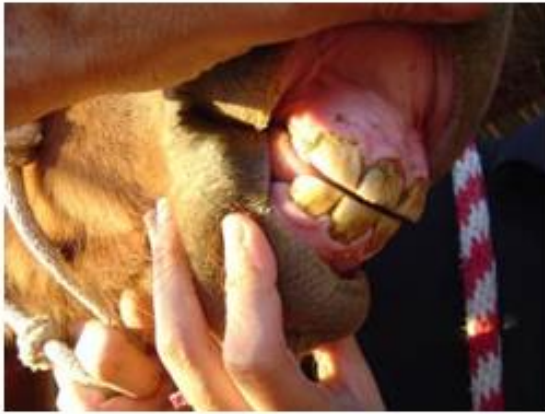
Figure 3. A weanling with central and intermediate deciduous teeth in, but corners incisors have not erupted yet. This means it is between 8 weeks and 8 months of age.

shed as the young horse ages. The deciduous teeth can be distinguished from permanent teeth because they are wider than they are tall and they have shallow roots. Twelve premolars will also erupt within 2 weeks of age, three on each side of the top and bottom jaws. However, premolars are typically not used in aging horses as they are more difficult to view.