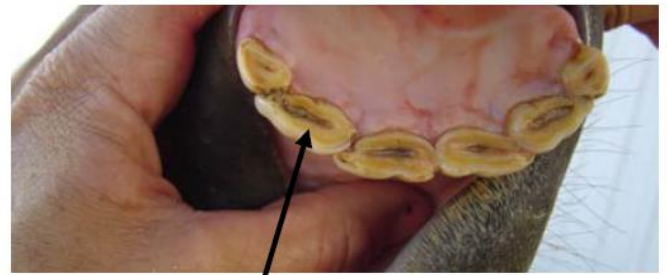
Figure 6b. Cups seen in a young horse of 6 years of age as all cups are present.

The shape of the grinding surface, amount of tooth seen below the gum line, and angle of the teeth change with age. A horse under 9 years of age will have a rectangular grinding surface, a horse from 9 years to mid-teens will have a more rounded grinding surface, while a horse in its later teens or older will have a triangular surface (Figures 7a and b).