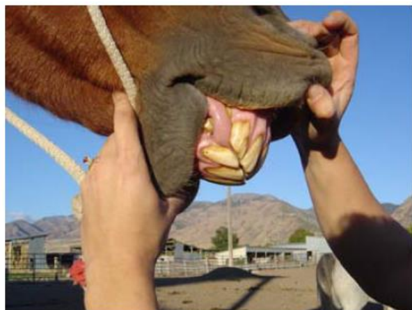
Figure 8b. Older horse with a more angled profile and more length of tooth visible.