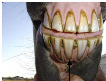
Figure 1. Horse's teeth.

Molars— Last three molars Premolars— first three large molars Canines Incisors