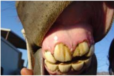
Figure 4. A horse at 2 ½ years old. Top central incisors are permanent but not in wear but bottom centrals are still deciduous.