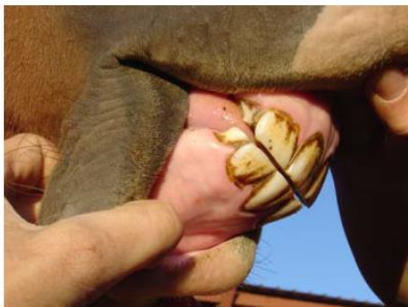
Figure 8a. Young horse with a more vertical profile and less length of tooth visible.

The younger horse will show a shorter tooth visible below the gum line, while a term used for the older horse is "long in the tooth" due to more visible tooth. When viewed from the side with lips parted, the young horse will exhibit a more vertical alignment to the incisors, while an older horse will have more of an angle with a more protruded appearance (Figures 8a and 8b).