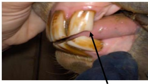
Figure 10. This mare has hook at 11 years old due to a lack of opposing surface at the back edge of the top molar.

Another subtle indicator on the same corner tooth is the 7- and 11-year hook. As the mouth changes shape the rear of the top and bottom corner incisors may not meet, allowing for a hook to form on the top incisor (Figure 10). The first time this hook appears is during the 7-year-old year and it will disappear at 9 years of age. It will reappear at 11 years of age and may remain through the mid-teens.