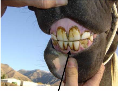
Figure 5. A horse at 3 ½ years of age. Centrals are permanent, and intermediates are ready to fall out.