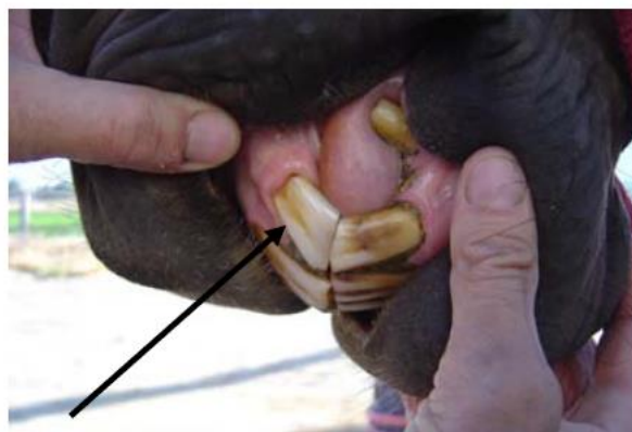
Figure 9. Galvayne's groove.

A more subtle indicator that can assist with aging the horse over 10 years of age is the Galvayne's Groove (Figure 9). This is a groove that appears near the gum line of the corner incisor. It begins at the center of the outer surface of the tooth in a 10-year-old. At 15 years the groove extends halfway down the tooth; at 20 years it extends the entire length of tooth; at 25 years the upper half of the groove is gone so a groove appears only in the bottom half; and at 30 years the groove is completely gone.