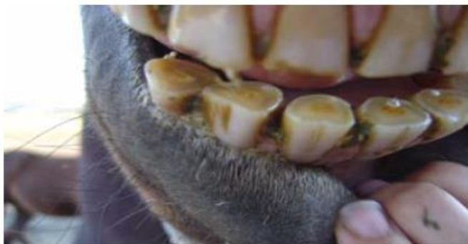
Figure 7b. Old horse's mouth with dental stars and triangular table.

The younger horse will show a shorter tooth visible below the gum line, while a term used for the older horse is "long in the tooth" due to more visible tooth. When viewed from the side with lips parted, the young horse will exhibit a more vertical alignment to the incisors, while an older horse will have more of an angle with a more protruded appearance (Figures 8a and 8b).