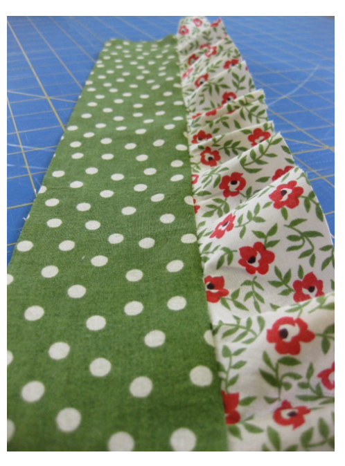
STEP 8: Hem the outer edge using preferred method.