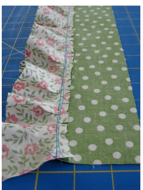
STEP 7: Press the seam flat towards the garment and trim excess to reduce bulk as needed.