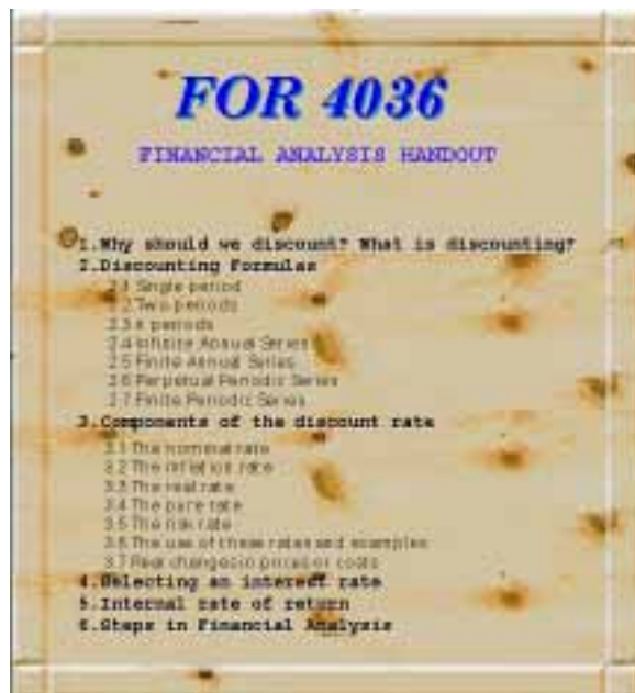
Figure 2. Screen Capture of the Contents Page of the Financial Analysis Chapter

Hypertext can be an extremely useful medium because it offers many alternative paths through a set of material. With a textbook, the material tends to follow a predefined path; but with hypertext, the possibilities are much more varied. The advantages of this are significant. Some readers may want to follow the shortest path through the material, not needing any additional explanation and not wanting to delve any deeper. Other students will welcome some additional explanation, including links to earlier material that may need to be reviewed. Still others will be interested enough to follow some “advanced topics” links. In addition to more detailed explanations and advanced topics, links allow students to jump to related sections, example problems, animated graphics, photographs, videos, a glossary, and a catalog of formulas. Figure 2 shows the Contents page of the Financial Analysis chapter.