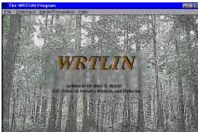
Figure 3. The Min Screen in WRITLIN.

1 The subjects covered in the course are listed later in this paper, and comments or suggestions regarding the course content are welcome.