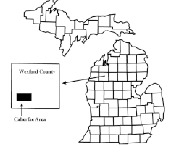
Figure 1. Location of Caberfae Forest area in northern lower MI.

A number of lecture/laboratory scheduling changes were needed to facilitate integration of the two courses. In previous