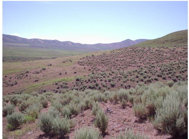
Figure 6 —Various vegetation states within close proximity with the Upland Gravelly Loam ecological site in northwestern Utah.

the sagebrush-bunchgrass community died in 2003, due to competition from bunchgrasses during drought conditions. Snakeweed was eliminated in the bluebunch wheatgrass community by the wildfire in 2001, and did not reestablish. Snakeweed density and cover remained constant in the sagebrush community. Snakeweed cover increased from 2 to 31 percent in the snakeweed community, despite the presence of Sandberg bluegrass. The data were used to evaluate and update the current Upland Gravelly Loam (Wyoming big sagebrush) ecological site description and its state-and-transition model to reflect vegetation changes associated with snakeweed invasion.