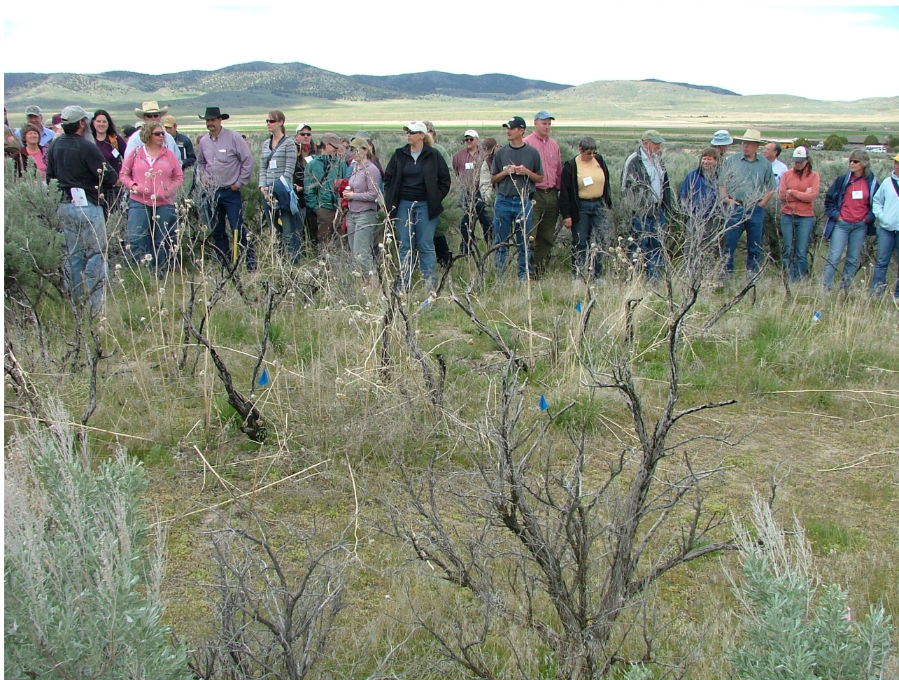
Figure 5. Eugene Schupp (at left) from Utah State University addressing tour participants at research plots located on the Golden Spike National Historic Site at Promontory, Utah.

aimed at determining methods of reincorporating perennial grasses into the understory. However, due to the incidence of cultural resources and artifacts within Golden Spike National Historic Site, park management prohibits the use of ground-disturbing activities such as drill seeding. As such, all seeding must be done via aerial broadcasting, a non-disturbing method of seed distribution. A primary goal of the experiment is to search for ways to increase the success of aerial broadcast seeding. Restoration treatments at GSNHS were implemented with the specific purpose of manipulating soil nutrients and other resource conditions to favor perennial grass establishment while addressing some of the factors that contribute to cheatgrass dominance.