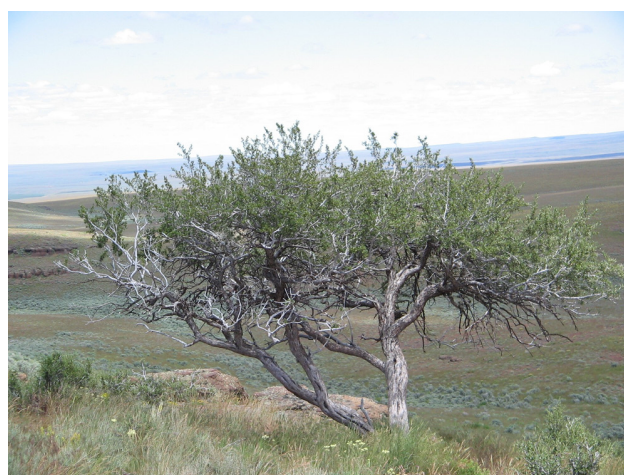
Figure 4. Discernible browse line on curl-leaf mountain mahogany tree.

Currently curl-leaf mountain mahogany stands are mature with many populations in decline, yet lack regeneration of new stands. It appears that this species does germinate, but fails to establish well in wildland settings. One successful, but expensive tool used to establish shrubs in critical areas has been to plant containerized plants. Problems with containerized plants include water demands of plants with established leaf area, but with small roots, and the attractiveness of the plant material to foraging wildlife. Less expensive materials and methods of establishing shrubs are needed to improve wildlife habitat.