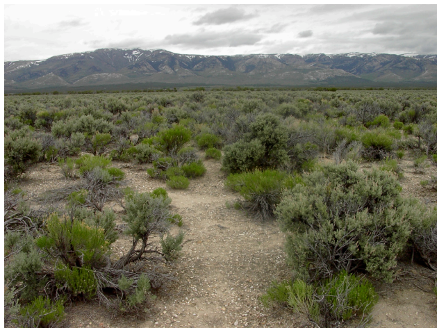
Figure 3. A typical shrubland site that was historically impacted by dry farming in the early 1900s. The recovery of native species in these areas has been variable across ecological sites.