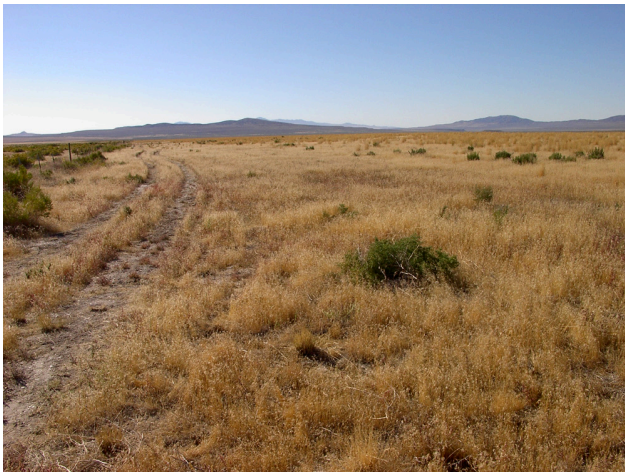
Figure 2. Cheatgrass dominated areas where revegetation demonstration areas were established as part of the Area-Wide project in 2008.

Utah State University (Chris Call, Merilynn Hirsch, and Beth Fowers), USDA Agricultural Research Service (Tom Monaco and Justin Williams), and Private landowners (Royce Larsen and Ken Spackman) showcased their research demonstration areas located four miles south of Park Valley, Utah and Highway 30 in the second stop. Burned by the 2005 wildfire, this area was previously dominated by Wyoming big sagebrush and greasewood ( Sarcobatus vermiculatus [Hook.] Torr.) with low species diversity in the shrub understory. This site was not reseeded after the fire and converted to a cheatgrass ( Bromus tectorum L.) dominated landscape thereafter (figure 2).