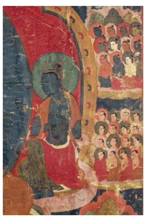
Amitabha, the Buddha of Boundless Light, rules over the Western Paradise of Sukhavati, the Pure Land of Ultimate Bliss, 16–17th century (University of Michigan, Anthropology Museum. Koelz Collection. © Asian Art Archives, University of Michigan).

there were an estimated 13,000 Chinese men in the new world.6 By the 1880's, the American census bureau recorded slightly over 100,000 Chinese living in the United States.7 In 1852, the Tin Hou and Kong Chow temples were constructed in San Francisco.8 It was from these immigrants that America was first introduced to Buddhism on a large scale, but it should be noted that this Chinese flavor of Buddhism had little effect on the future "White Buddhism" in America. It was simply America's first encounter with the tradition. Two events following Chinese immigration can be credited with the establishment of Buddhism in America. First was the founding of the Theosophical Society in New York City followed by the World's Parliament of Religions.