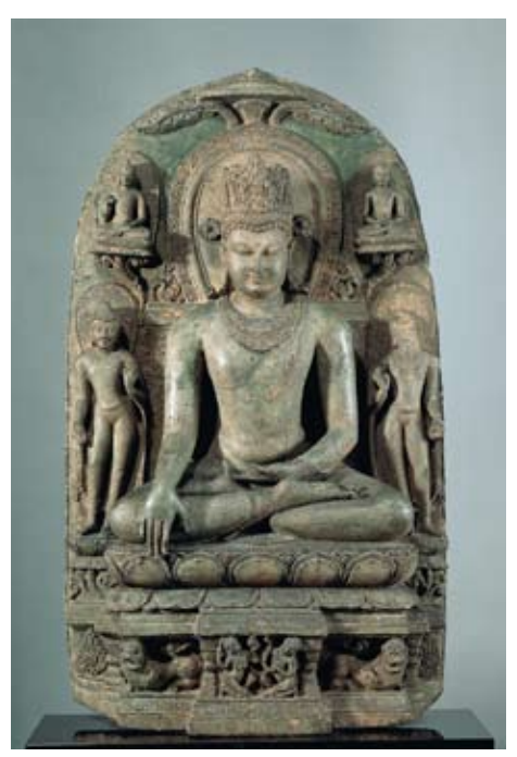
Crowned Buddha Shakyamuni (Siddhartha Gautama), 11th century, India, Bihar (Asia Society Museum, New York, New York).

The Buddha's awakening to Dharma , the ultimate truth of life, came after