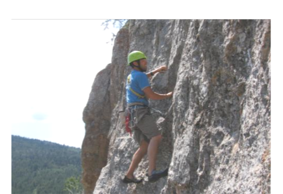
Recreation Resources Management