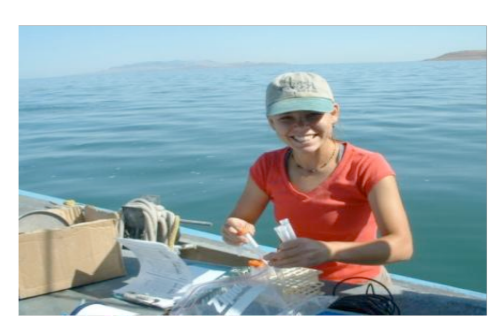
Fisheries and Aquatic Sciences