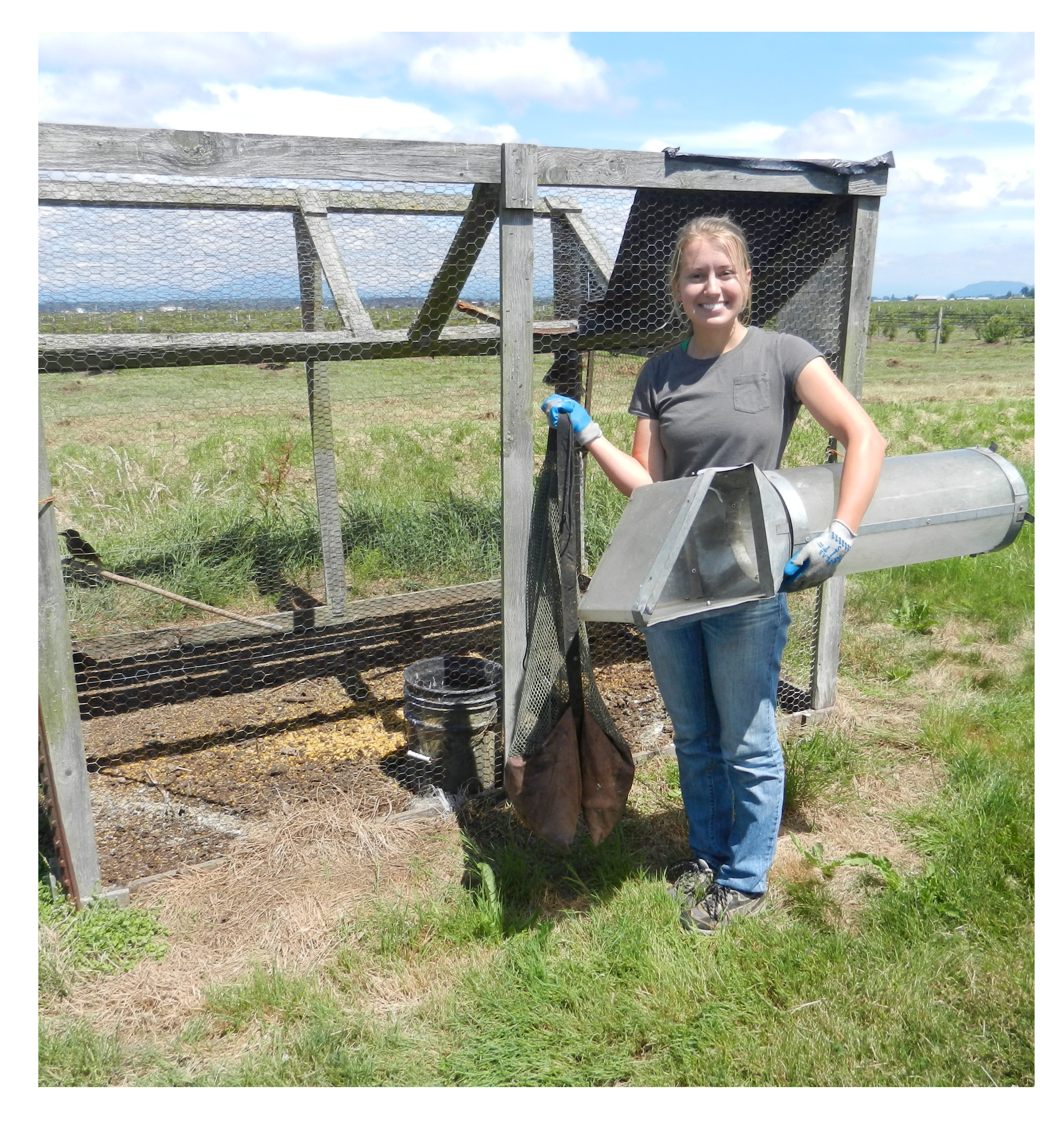
European Starling Damage Management