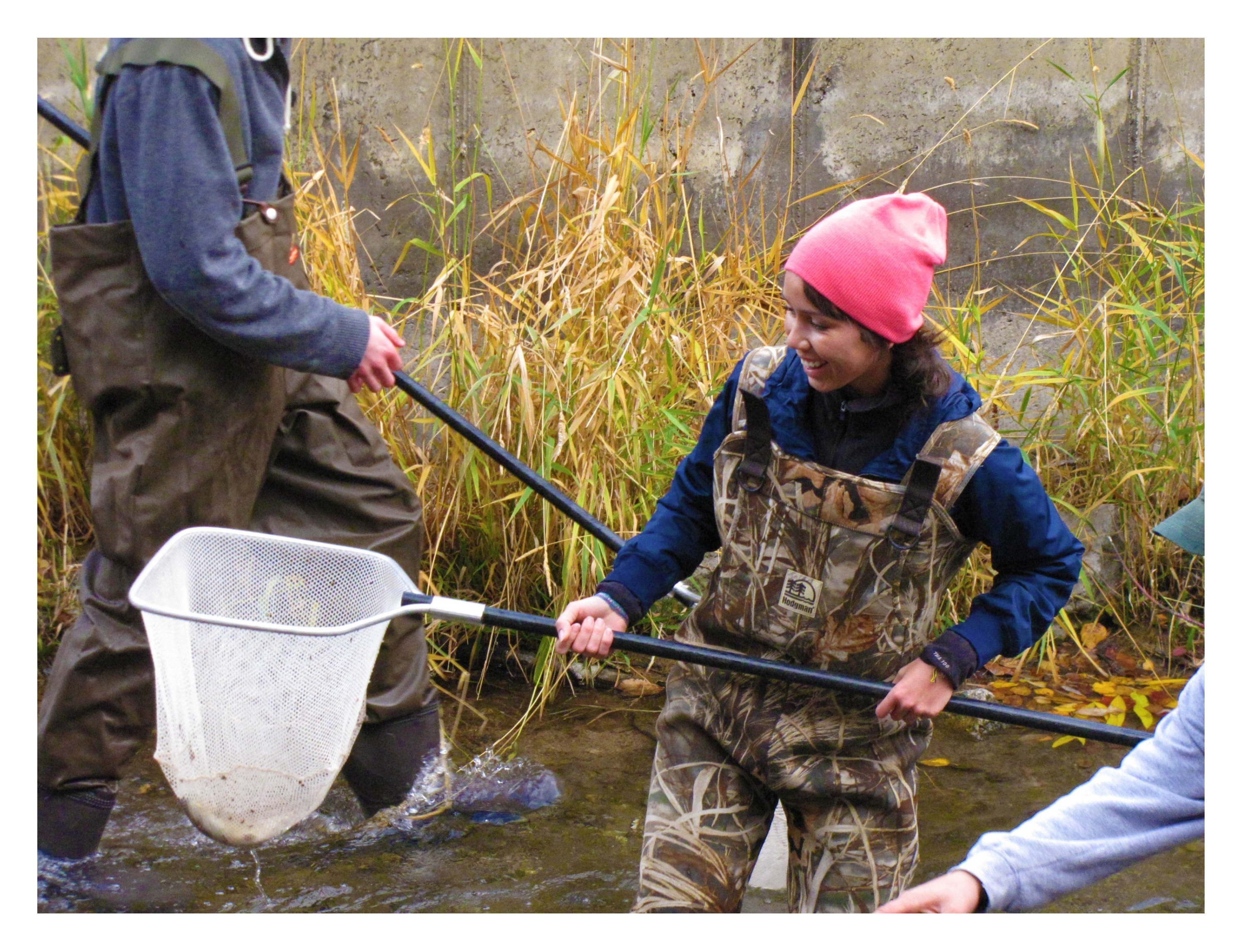
Brown trout removal project