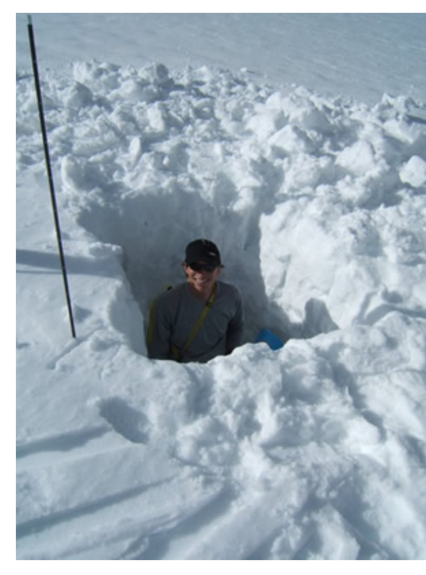
Watershed and Earth Systems