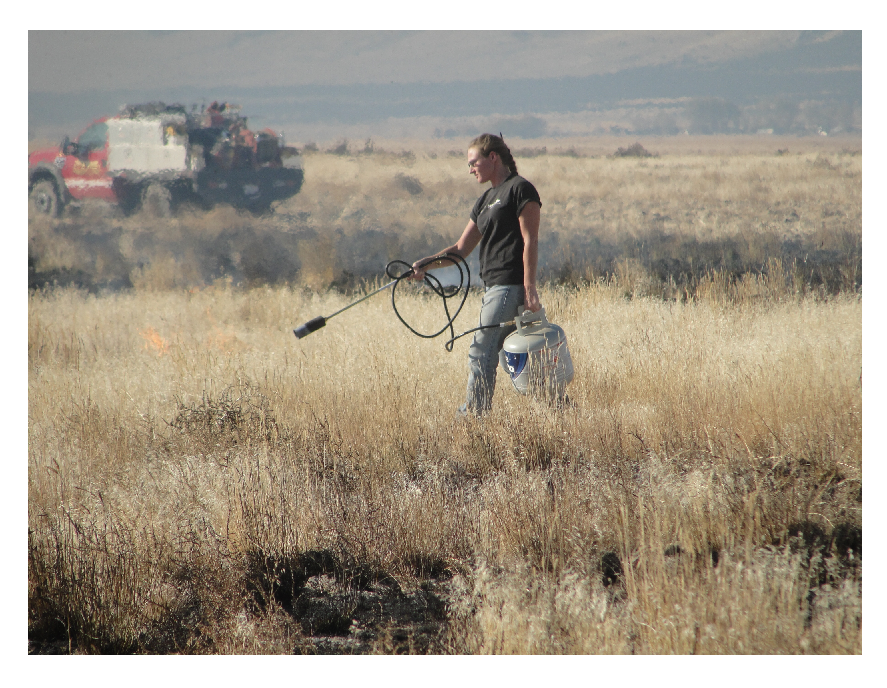
Invasive weed control