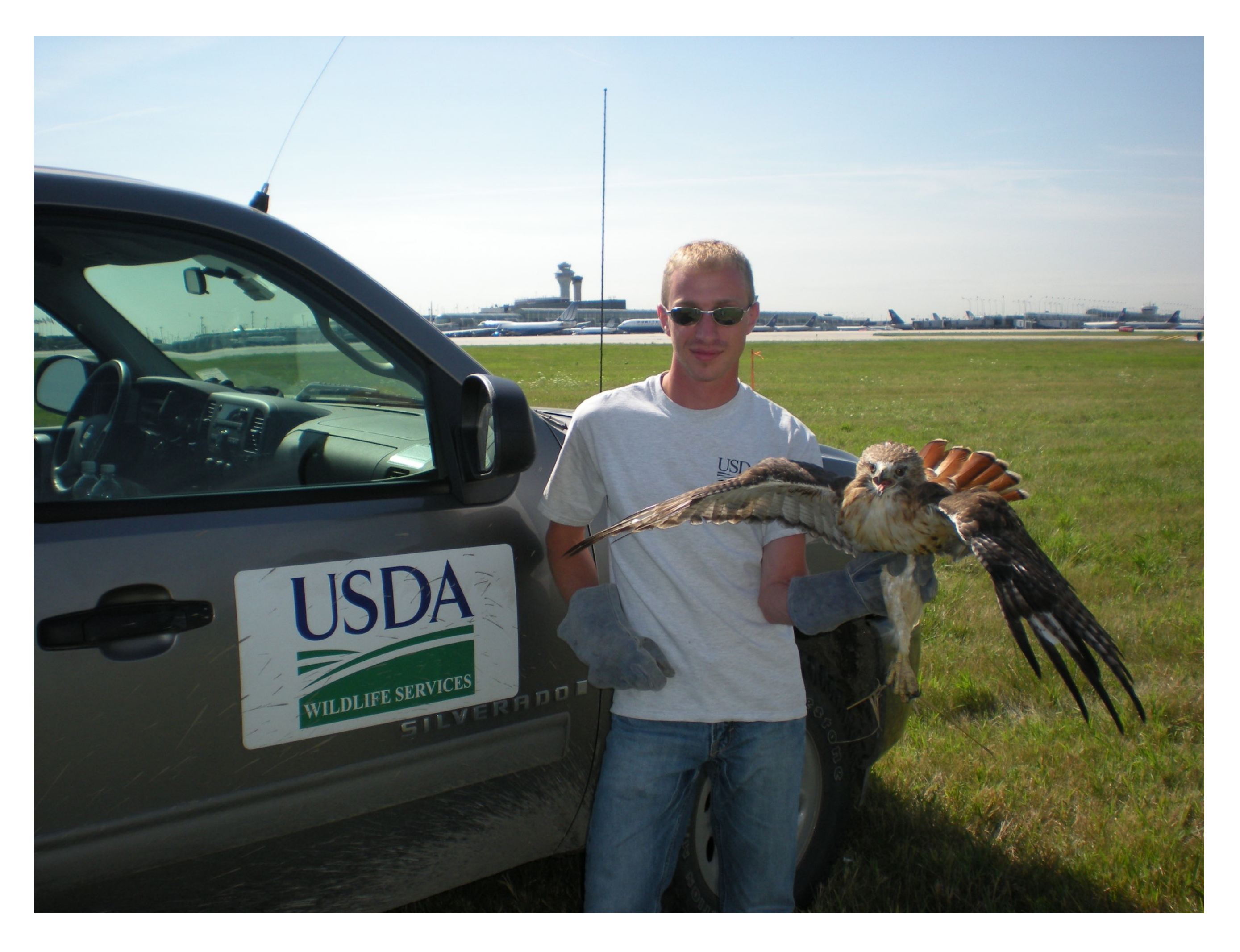
Airport wildlife conflict management