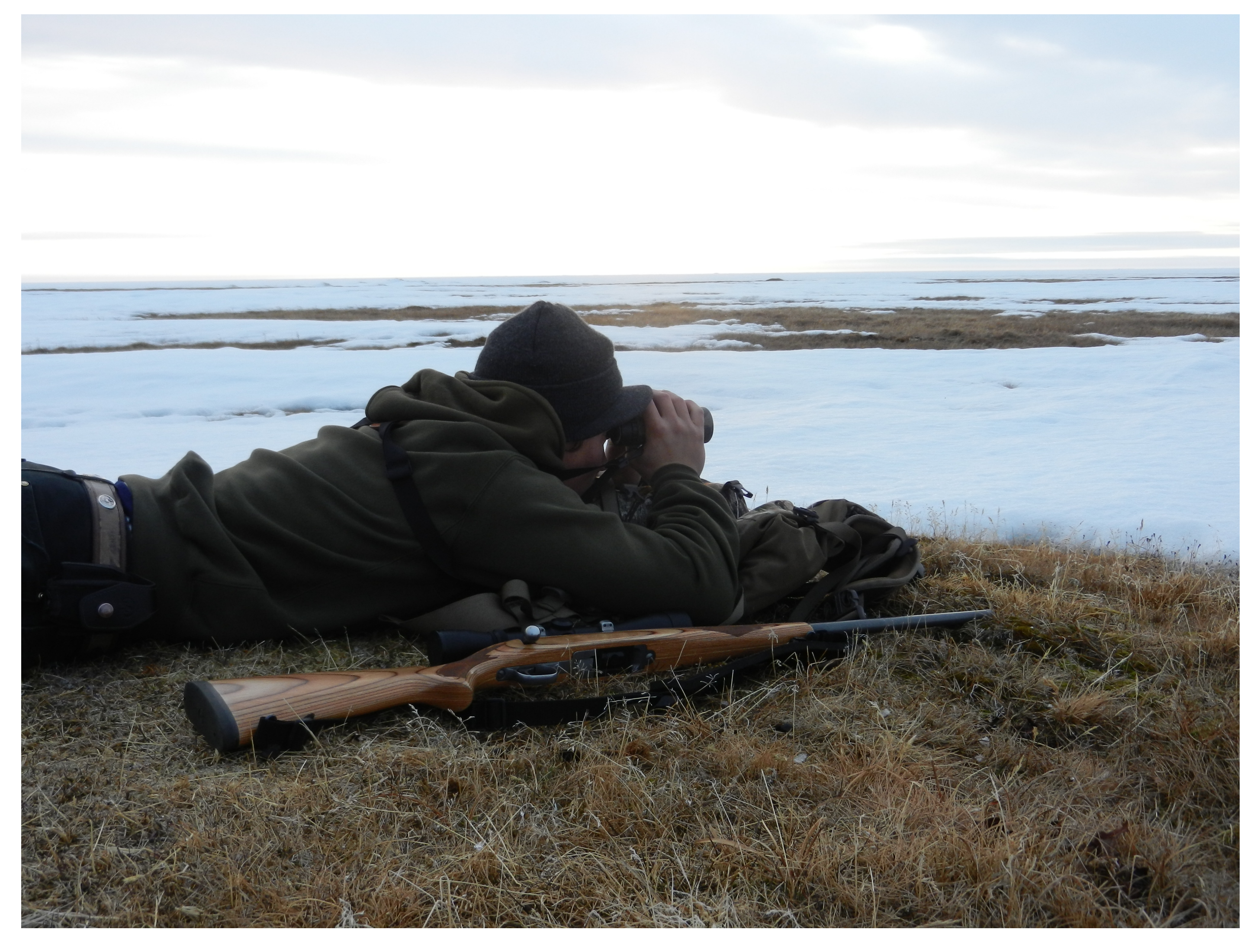
Arctic Fox control in the Barrow Steller's Eider Conservation Planning Area