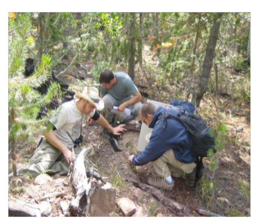
Conservation and Restoration Ecology