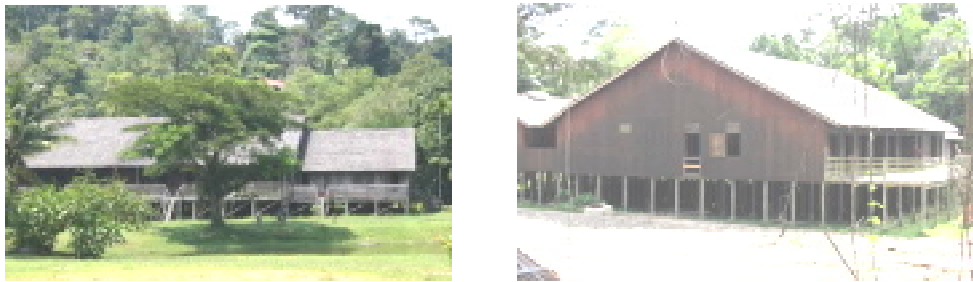
Figure 2: Stilts house in Huma Betang

In addition to its elongated shape, Huma Betang is also built on stilts which can be quite high, reaching to around 3 to 5 meters in height—the great height of the stilts referring to the mightiness of the spears commonly used by the local tribe. The top of the Long House is usually used for the living quarter of several families while the lower level functions as a communal room where everyone gathers [4].