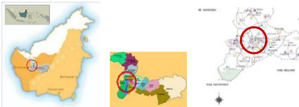
Figure 1: Map of Sintang village in West Kalimantan

Located in Sintang a small village in the inland of Kalimantan, approximately 8-10 hours drive from Pontianak, West Kalimantan, the project is an expression of concern from a Dutch missionary. Father Jacques Maessen, the name of the missionary, has now been living in the remote village of Sintang in West Kalimantan for almost 50 years [1].