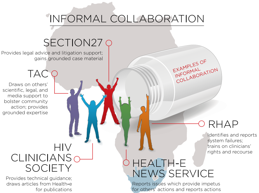
FIGURE 2 Informal Collaborations

the Clinicians Society frequently run trainings for TAC staff and members to ensure they understand the science and their rights under national policy. The Clinicians Society draws some of the material it uses to educate its members from stories published elsewhere by Health-e; its June 2015 issue of HIV Nursing Matters included Health-e stories on the pneumococcal vaccine, sex work, and about a young woman who was having sex with older men to get money to feed her family. The magazine's March 2015 issue carried Health-e stories on a Constitutional Court judgment regarding health care providers and on the RHAP's "rural proofing" guidelines.