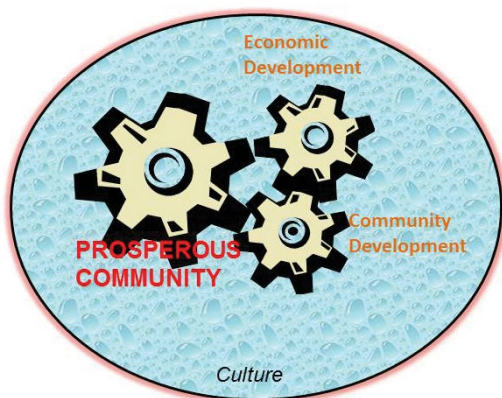
FIGURE 2 Economic Development and Community Development: An Interdependence