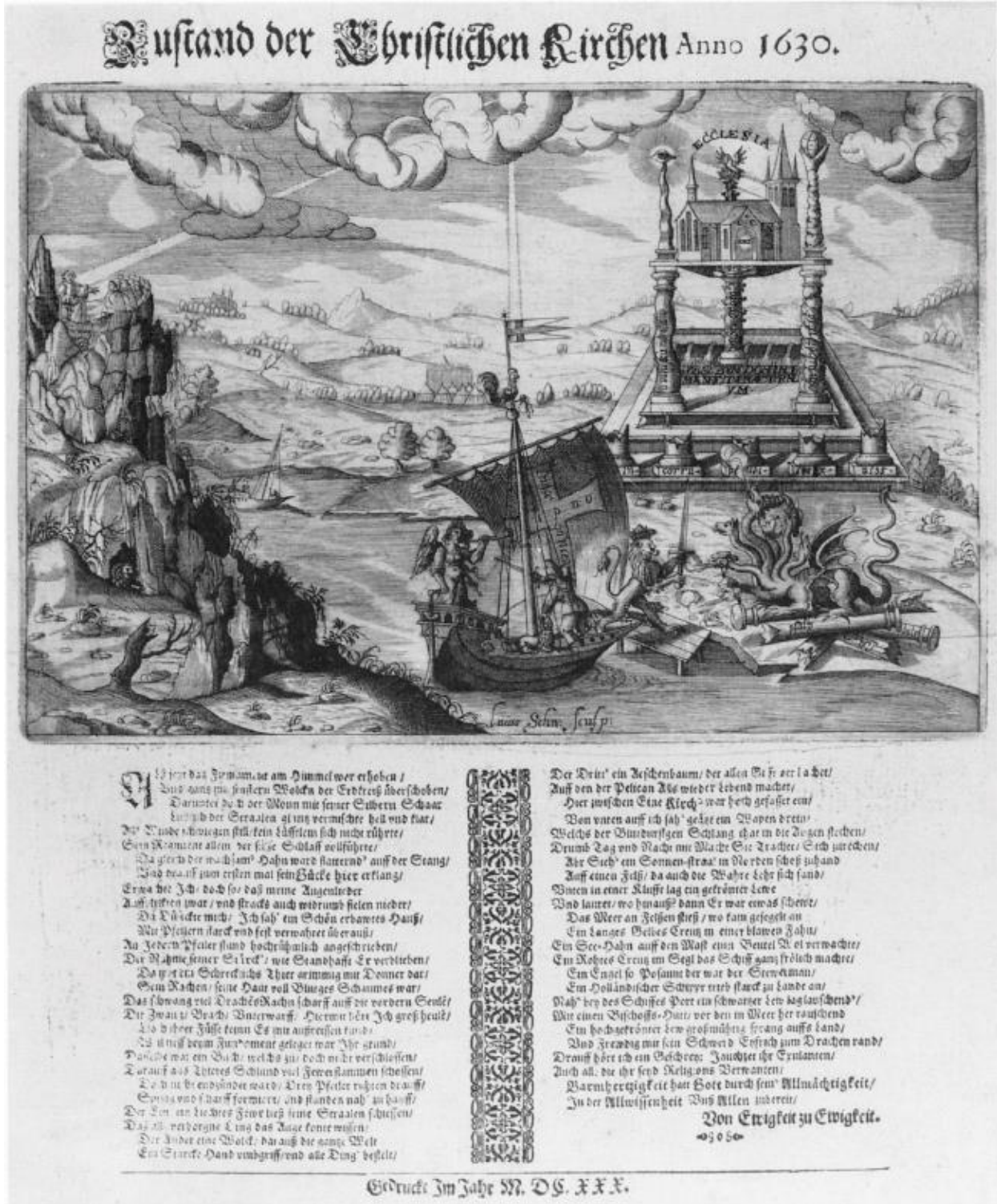
Fig. 2 – “Swedish Lion and the Dragon.” Paas, “The Changing Image of Gustavus Adolphus on German Broadshets, 1630-3.” (219)