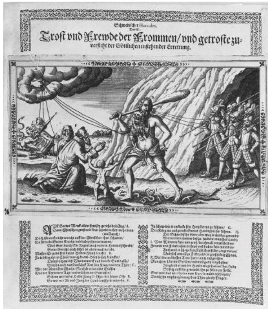
Fig. 1 - “The Swedish Hercules”- Paas, “The Changing Image of Gustavus Adolphus,”(219).