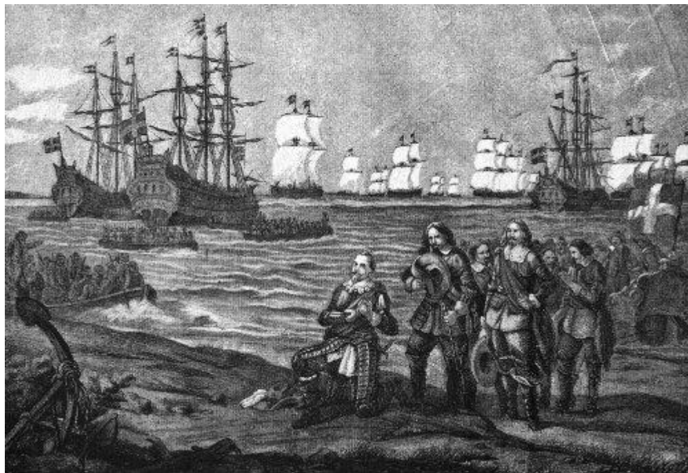
Fig. 6: “Landing in Germany” – “Discerning History”