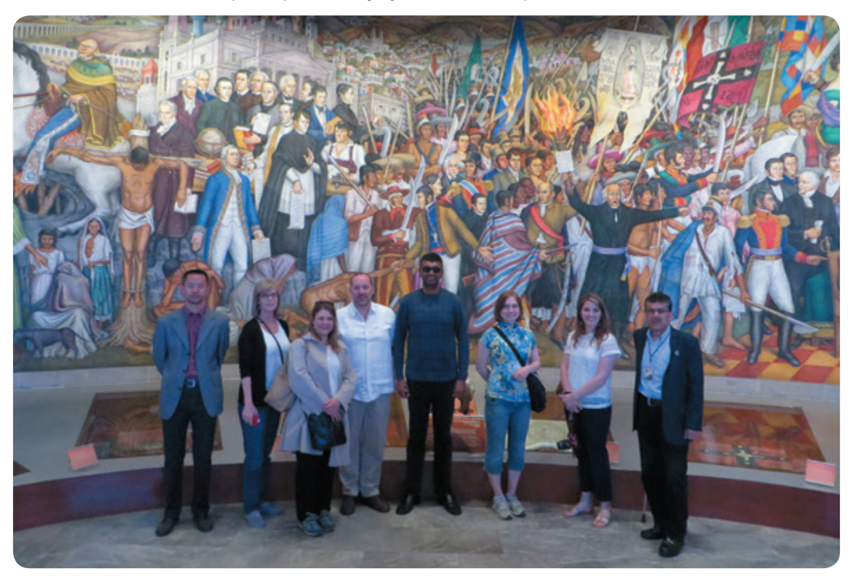
GVSU Delegates enjoying a historic mural at the Castillo de Chapultepec in Mexico City.

the 'Socio-Cultural Impact of Educational Technology on Minority and Indigenous Learners' at the 2014 Program, and the two faculty members are currently working on a collaborative scholarly presentation and publication project.