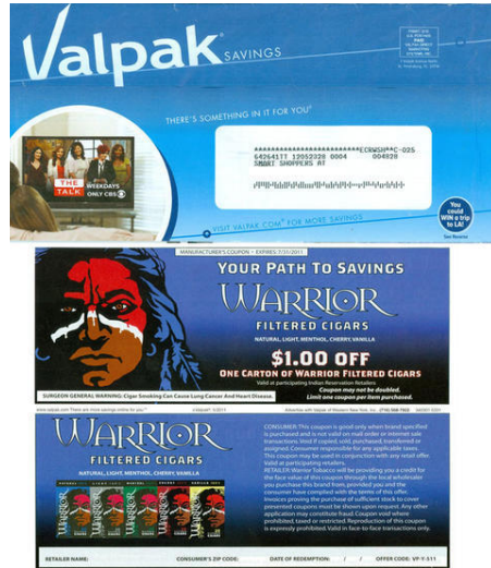
FIGURE 4 Warrior Tobacco Advertisement (2011)

cessation, policy, and communications initiatives. Progress has included tobacco advertising bans, warning labels, public service campaigns, lawsuits, smoke-free laws, steep increases in cigarette taxes, and other forms of government regulation. Since the early 1960s, smoking prevalence nationwide has fallen from 42 percent to 17.3 percent, with more than eight million premature deaths averted and every individual gaining 19-20 years of life expectancy (Holford, 2014; U.S. Centers for Disease Control and Prevention, 2014). The campaign against tobacco has been called the greatest public health success story of the past 50 years.