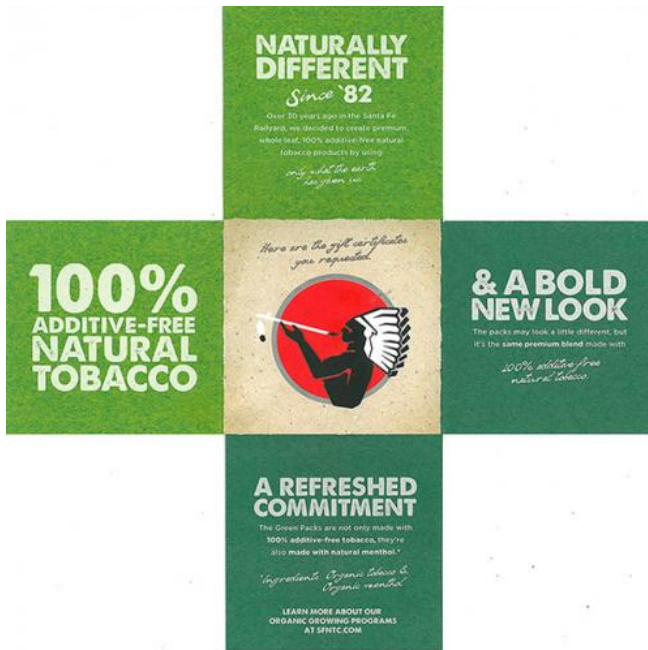
FIGURE 5 American Spirit Tobacco Advertisement (2013).

ClearWay Minnesota’s board and staff reported changes in attitude and outlook that could improve the process of developing ideas, approving them, and collaborating with tribal partners. Some wrote of dawning awareness about how they had viewed things before: “I have been unrealistic about the time it might take to develop meaningful relationships with tribes. The tribes we have [as existing collaborators] seem miraculous now.” One participant wrote: “The knowledge, or more importantly the understanding, I gain from these symposia will help me be more instinctively thoughtful and inclusive in my thinking about tobacco control issues as they relate to American Indian Nations and people in Minnesota.”