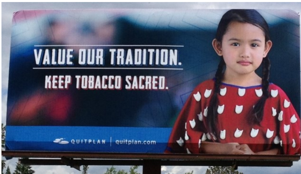
FIGURE 6 ClearWay Minnesota Advertisement (2014)

improved existing relationships with Indian individuals and groups, and expanded our name recognition and reputation as an organization working to improve life and health for all Minnesotans. We have also built inroads for related work by other public health organizations by creating a positive association with mainstream health efforts for Indians and by showing respect and understanding for the ways of others. By partnering with Native Americans in Philanthropy, we have positioned ourselves as a leader in this area both in Minnesota and throughout the country. And it is a two-way relationship: Just as we were able to gain context around our work with American Indian Nations in Minnesota, they learned about the harm commercial tobacco abuse causes their people and how organizations like ours can help to reduce it. These new partnerships have potential to sustain the movement around health equity for Indians even after ClearWay's 25-year lifespan ends.