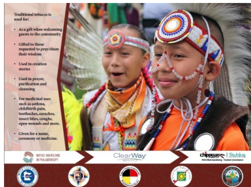
FIGURE 7 Tribal Tobacco Education and Policy Initiative Calendar (2014)

these communities, and about our respect for their views and their values. It has made our collaborations much easier and more productive.”