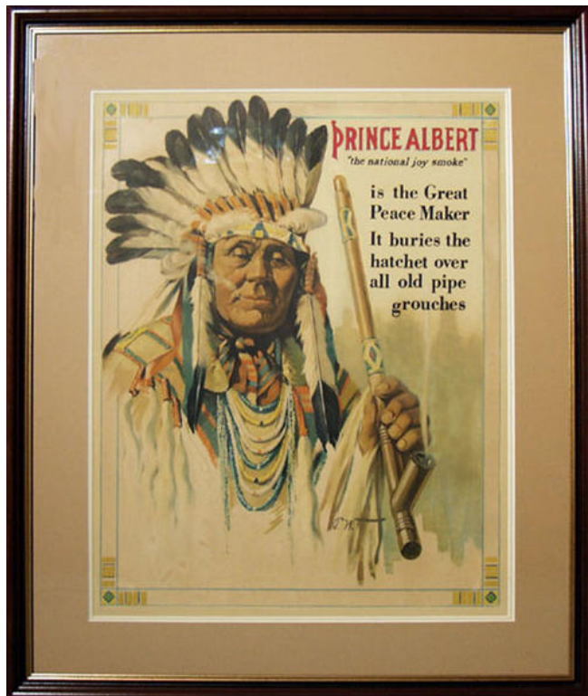
FIGURE 2 Prince Albert Tobacco Advertisement (1914)

of Native life (Indian Land Tenure Foundation, 2009).