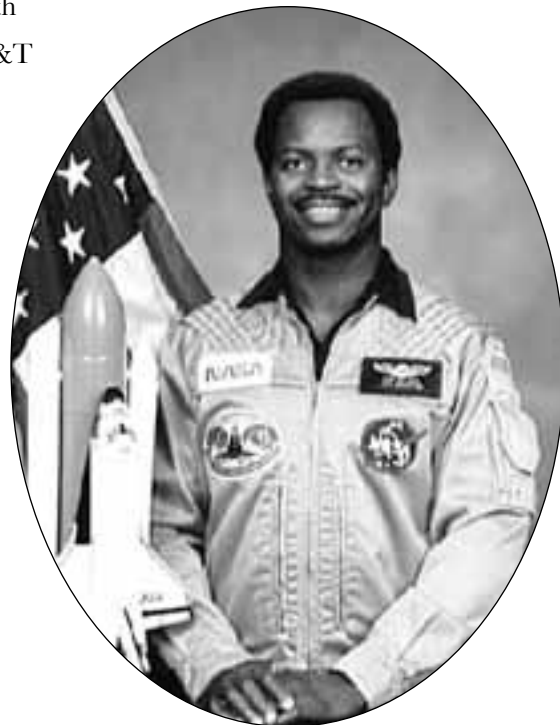
Ronald E. McNair, Ph.D.

After his death in the USS Challenger space shuttle accident in January 1986, members of Congress provided funding for the Ronald E. McNair Post-baccalaureate Achievement Program. The goal is to encourage low-income, first generation students, as well as students who are traditionally underrepresented in graduate schools, to expand their opportunities by pursuing graduate studies.