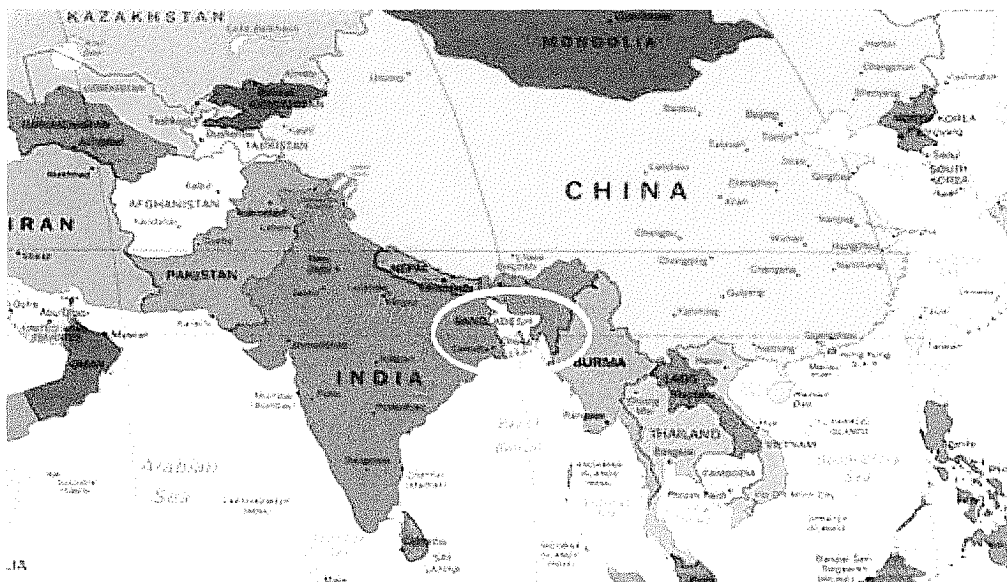
Figure 1: Location of Bangladesh 9

The People's Republic of Bangladesh is a low lying country in southern Asia and the largest wetland in the world. Bangladesh is bordered by India to the west, north, and east. Myanmar also borders Bangladesh to its east, while the Bay of Bengal is found to its south. The history of Bangladesh is a rich one ranging from its absorption into the Mughul Empire in the 16 th century to the British influence during the 18 th , 19 th , and 20 th centuries. One of the most influential events in recent Bangladeshi history was the 1971 War of Independence against Pakistan. This nine month war resulted in the independence of East Pakistan (Bangladesh) from Pakistan (U.S. Department of State, 2004).