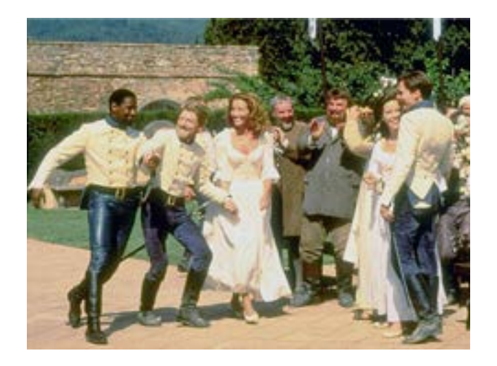
Image 4: Still from the Movie "Much Ado About Nothing" Directed by Kenneth Brannaugh, 2002