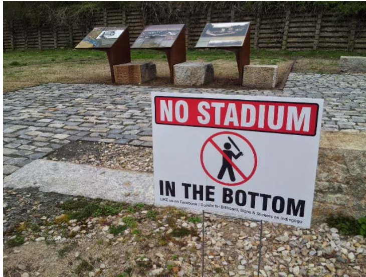
Image 1. Lumpkin's Jail" Archaeology Site, Shockoe Bottom: Protest and interpretive signage mark the site known by 19th century Blacks as the "devil's half-acre", April 8, 2014.

Most people in Richmond know that Virginia was long associated with slavery. Few, however, are aware of the central role the capital city played in that “peculiar institution.”