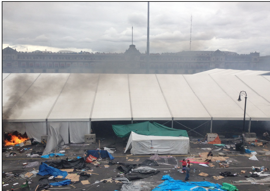
Figure 1. Remnants of the tent city burning in the zocalo.

waiting for a whatsapp message or facebook update. I recalled my last memory in the zocalo, a snapshot of a man's face with deep laugh-lines around his dark eyes, wrinkled brow, and a faded blue bandana lost in a mass of black uniforms.