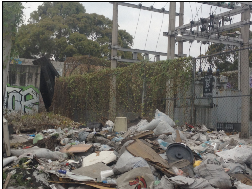
Figure 2. The road to Iztapalapa.

“They want to make robots of our students and teachers. An education reform should focus on pedagogy and didactic materials. This is a labor reform,” a Mexico City public school teacher said, as she glanced over her shoulder at the large crowd still lingering in the park. It was one of the first community education forums I had attended and her words captured the very real stakes for public education. At least ten people crowded around her after she denounced the Mexican Government’s treatment of teachers and the future outcomes of the constitutional modifications made under the reform. She raised her left fist high in the air and sang: “Desde el hondo crisol de la Patria se levanta el clamor popular, ya se anuncia la nueva alborada, todo el pueblo comienza a cantar.” Others joined her in singing “venceremos,” a hymn adopted by the Mexican teachers’ movement from Popular Unity —a 1970s Chilean coalition of left-wing socialist and communist political parties. The group dispersed and I introduced myself. “You speak Spanish well,” she smiled, and then asked, “Where are you from?” We stood on a makeshift stage in the park while we broke down tables from the forum and I told her how I had spent some of high school and college in Mexico. “Then you get it,” she said, “why I can’t retire even after thirty years.” I nodded. “Did you hear the children?” she asked and