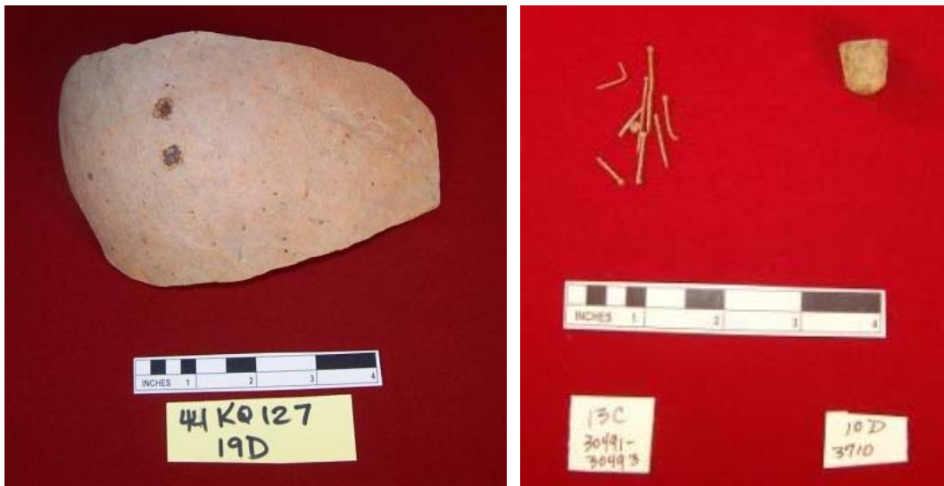
Figures 4 and 5

In addition to an abundance of classic eighteenth century imported ceramics, there was a large colonoware pot sherd, which was excavated from the external kitchen trash pit (Fig. 4). The presence within the kitchen, where pots and pans were readily furnished from the white residents, shows the representation of Black culture within a white space. Whether this colonoware pot was made on the plantation, or given to the cook as a gift from the quarter folk, is debatable. However, its context, as an African derived cooking vessel, locally made by enslaved Africans, shows that the cook, while living in a white landscape, flavored his or her space with material that represented their heritage.