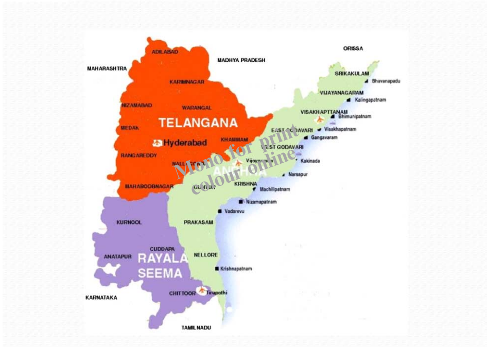
Figure 1. Map of Andhra Pradesh illustrating the three regions: Telangana, coastal Andhra, and Rayalseema.

placed in relation to the people of Andhra and in this partnership the major partner will derive all the advantages immediately while Telangana itself may be converted into a colony by the enterprising coastal Andhra. (State Reorganisation Commission cited in the Sri Krishna Committee Report, Government of India, 2010, p. 6)