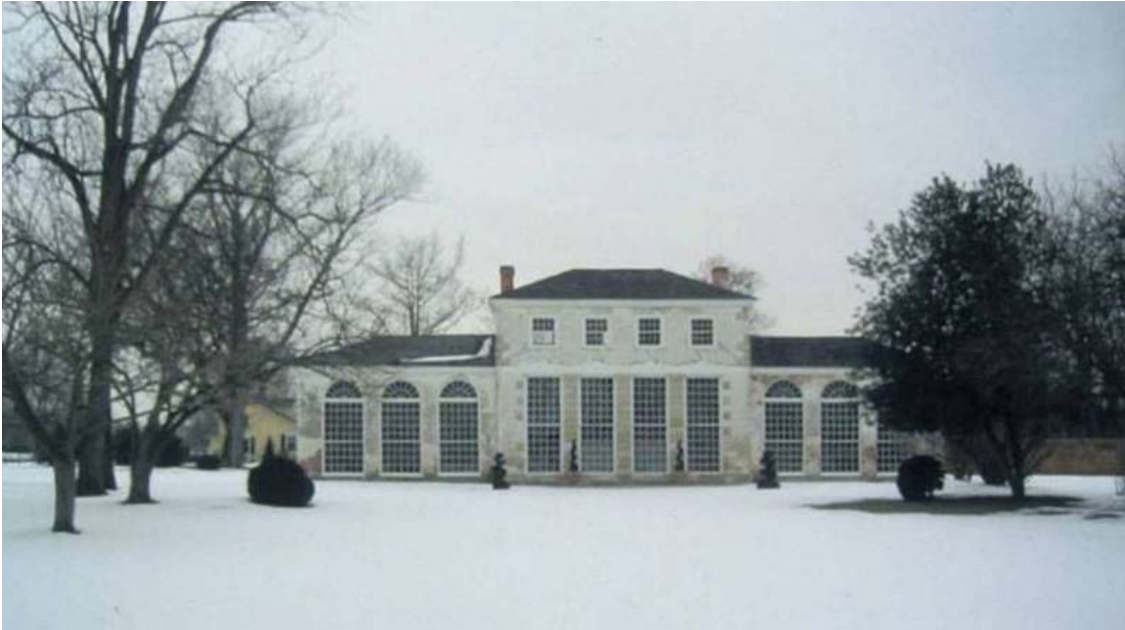
Greenhouse as it appears today ( view an enlarged version of this photo ).

original greenhouse, which did not have a heating system within it. This would have been a garden.