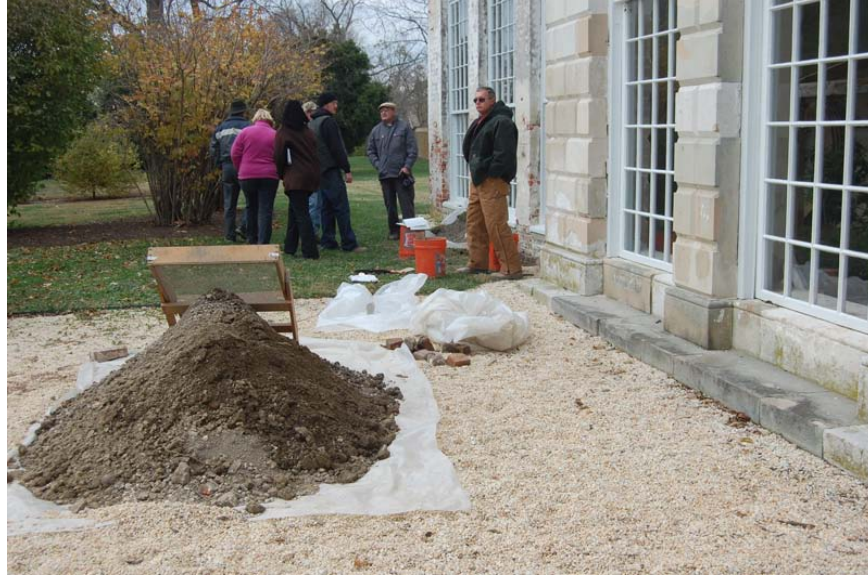
Team at work at the greenhouse (view an enlarged version of this photo ).

Return to March 2011 Newsletter: http://www.diaspora.uiuc.edu/news0311/news0311.html