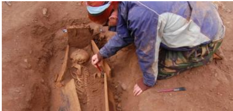
Excavation of the grave of a captive African at St. Helena in 2008.

A team of British archaeologists uncovered the first graves last year after preparation had begun to build an access road to the site of the planned new airport on St. Helena.