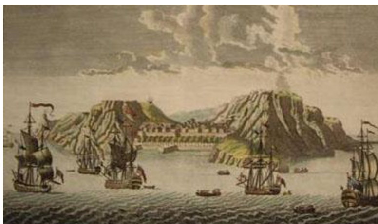
"A View of the Town and Island of St. Helena in the Atlantic Ocean belonging to the English East India Company," engraving circa 1790.

The excavations raise very sensitive issues, not least on St. Helena itself. The island, a vital staging post on the route to India, was governed for almost 200 years by the East India Company, and slaves were used there until long after Britain outlawed the slave trade in 1807. Many St. Helenians are themselves descendants of these early slaves, who remained on the island after they were freed, and there is some reluctance to acknowledge that most people can trace their origins partly to slavery as well as to the early British settlers and labourers brought in from the far corners of the British Empire.