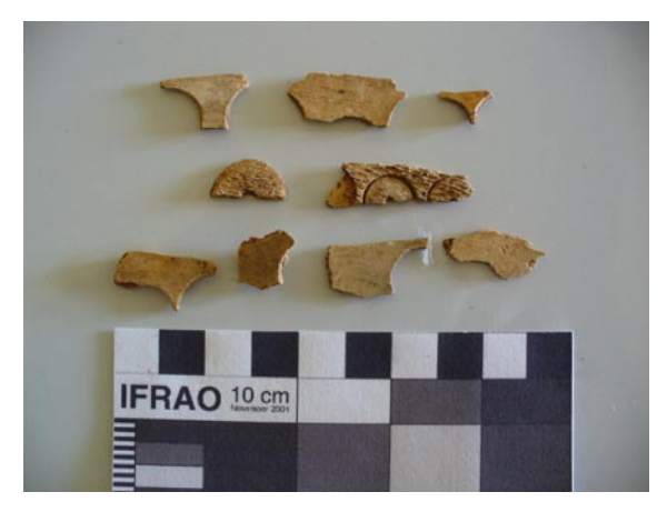
Figure 4. Bone button blanks from the cottage industry manufacture of bone buttons on the site, recovered from middens behind and upslope from the laborer quarters at the Magens House site.

The Magens House compound presents a unique opportunity to examine social complexity in a nineteenth century house compound in a port town of the Caribbean. It provides a site-based case study that provides details on local lifeways, but which at the same time sheds light on regional and global interactions expressed in a port-town setting. Those who came to Charlotte Amalie and lived at this site hailed from diverse places including Copenhagen, Glasgow, Paris, Boston, Philadelphia, the Canary Islands, and from an array of Caribbean islands spanning the region and its colonial polities, from Puerto Rico to Barbados. Many were descendents of people from many nations of Africa whose presence was initially coerced via the slave trade. All of these people arrived at this residence, on an island that was at once marginal, but at the same time a center of global trade and interaction. Such is the nature of a nineteenth century Caribbean port town and the multi-scalar social and economic infrastructures of which it is a part.