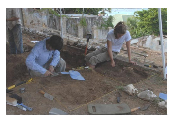
Figure 2. Excavation in progress at the Magens House compound.

This "hole" on the side of the hill is the house compound of the former Magens House. The Magens House is now the site of intensive archaeological and historical research by Syracuse University that is exploring the complexity of life in the nineteenth century port town of Charlotte Amalie (Figure 2). This site is being used to tell the story of life of all of those who lived in the households associated with this compound. The property contains the ruins of the Magens House, which was destroyed by hurricane Marilyn in 1995, along with intact outbuildings including a cook house and slave/servant quarters and two houses that were once occupied by clerks and other mid-level clerks and managers. Unlike many properties in the