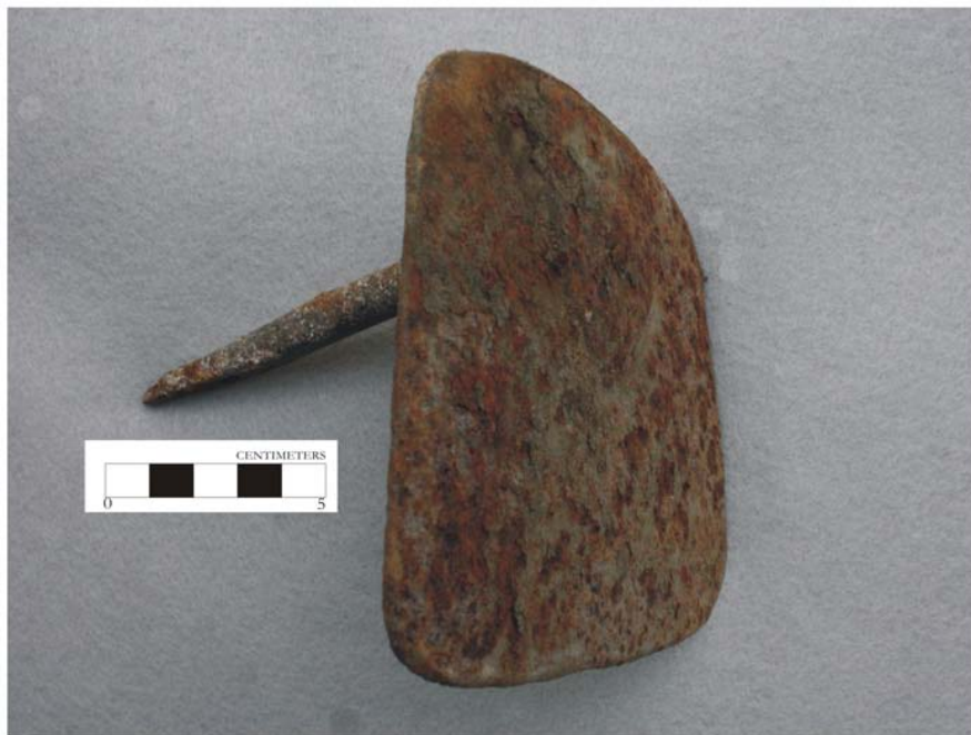
Figure 5. The hoe blade.

At least one other example of folk ritual using a hoe blade is recorded. In Calvert County, Maryland, a hoe blade was discovered in the bottom of a pit feature located directly outside the main doorway to the Indian Rest cabin, occupied from the 1870s through 1934 by at least two black families. Based upon its location and contents, the pit was interpreted as a conjure deposit, with the iron of the hoe blade acting in a protective capacity. The Terminus Post Quem (TPQ) for the feature was 1903, indicating that folk ritual practices using iron hoe blades continued at least into the early twentieth century (Derr 2007: 51). A large iron implement (an axe) has also been interpreted as serving a protective ritual function in a dairy at the Thomas Williams site in Delaware, placed there between 1887 and the 1920s by the free black Stump family (de Cunzo 2004). It is not clear whether the hoe or axe configuration of those tools had any significant meaning in ritual context, or whether their importance lay solely in their iron content or in the fact that they were edged tools.