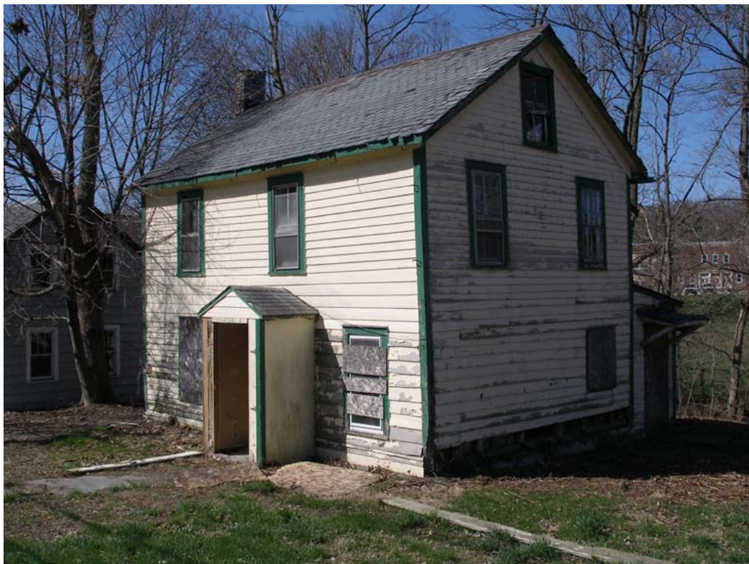
Figure 2. Photograph of house exterior, April 14, 2009 9 (Photo by Mike Tomkins).

The Mann family homestead at 37 Mill Street was a frame building with a dry-laid stone foundation. It was built circa 1857 of large timbers cut in the late eighteenth century, and reused from some earlier building, likely a barn or other large post and beam structure. The house never contained a fireplace; instead, an iron stove located near the center of the house provided heat for cooking and to warm the house. The presence of large amounts of coal, coal ash, coal slag, and coal cinder throughout the archaeological assemblage, including the earliest contexts, indicates that this stove burned coal instead of wood. The chimney stack for the stove, likely built of brick, extended up through the second floor and into the attic, exiting near the center of the house.