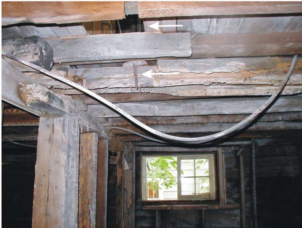
Figure 4. Hoe blade in situ. The upper arrow points to the hole in the second floor for the no longer extant chimney; the lower arrow points to the hoe blade, June 12, 2009.

The iron hoe blade was found resting on a hand-hewn second floor joist between the first floor ceiling and the second story floor, immediately south of the former hole for the chimney stack and beneath a saw-cut timber (see Figures 3 and 4). The hand-hewn floor joist had been notched to accommodate the former chimney stack; the hoe blade was located within the notch. The location, hidden between the first and second floors and directly associated with a chimney, strongly suggests that this is an example of a folk ritual concealment. Characteristics of the hoe are consistent with a late nineteenth through early twentieth century manufacturing date (see Figure 5). Based solely on the manufacturing date of the hoe blade, it could have been associated with either the Mann family or later, twentieth century occupants of the house. Following Fennell's lead (2000), the hoe blade is evaluated according to both black and European folk ritual traditions.