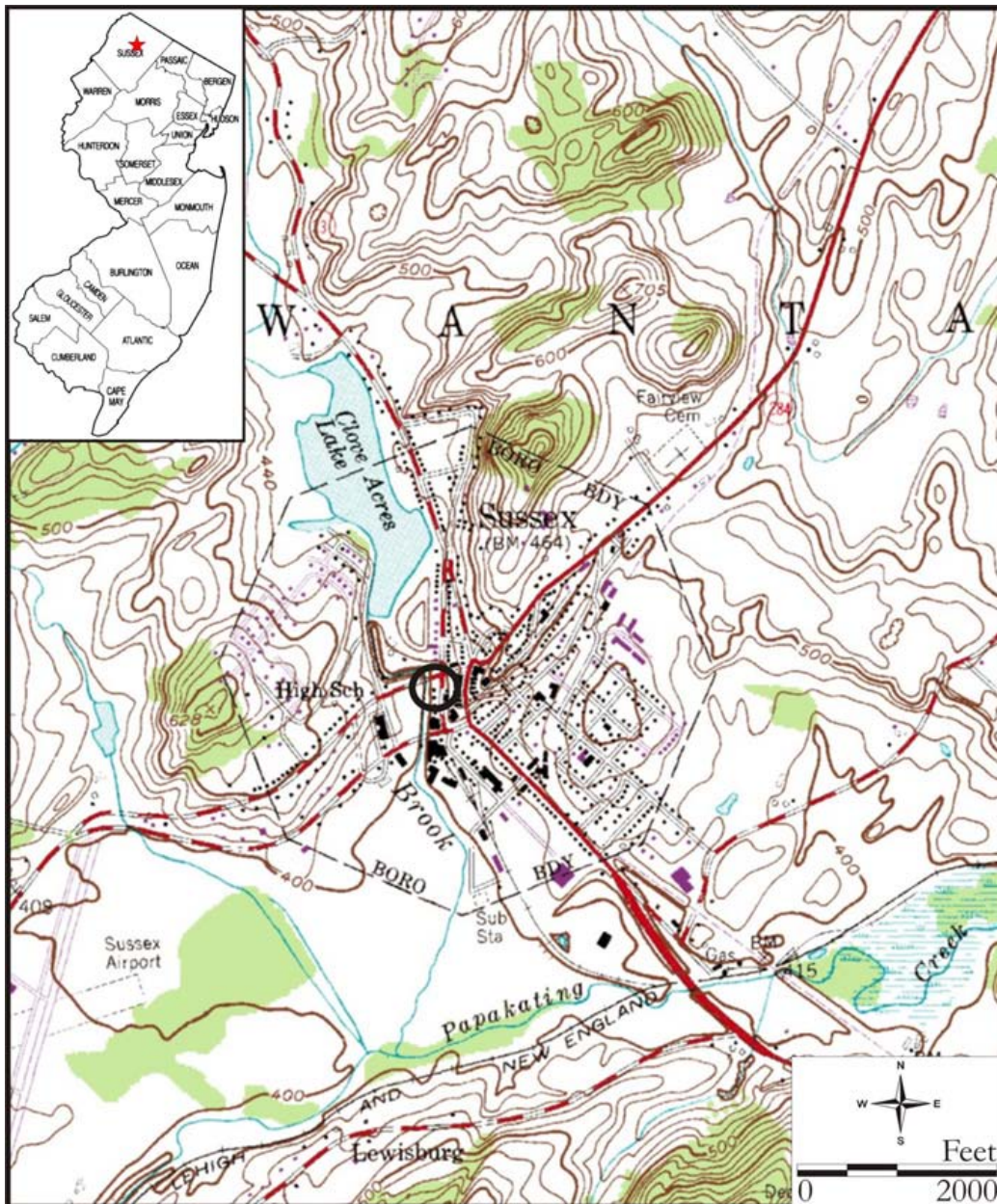
Figure 1. U.S.G.S. map showing site location.