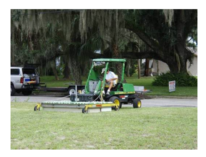
Figure 5. Radar tomography survey.

On land, the area around a mineral spring – a source of fresh water – offered possibilities. Witten Technologies provided hi-resolution 3D underground imagery: the radar tomography (Figure 5) involved a mobile array of rapid-fire GPR antennas, precise laser-tracking and sophisticated image processing software. In the scanning phase, a commercial tractor propelled the array across the ground at about two miles per hour, while the seventeen antennas inside fired in a controlled but rapid sequence and a laser surveyor's instrument tracked the array's position. The result provides possible architectural features over the three acres around the spring as well as many other possible archaeological features.<sup>2</sup>