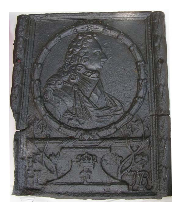
Figure 2. Cast Iron Fireback. Profile is King Frederick IV of Denmark.

Residents have provided some hints of the material record of this region. In 1971, a fireback, heavy and quite unexpected for the locale (Figure 2), was found near the point where the Braden River enters the Manatee. In 2007, a neighbor to the Manatee Mineral Spring, while digging their garden, recovered a Harper's Ferry Model 1816 bayonet. To the north, in the Little Manatee River, a drum was pulled out of the river's muck (see photograph in Landers 1999:232).