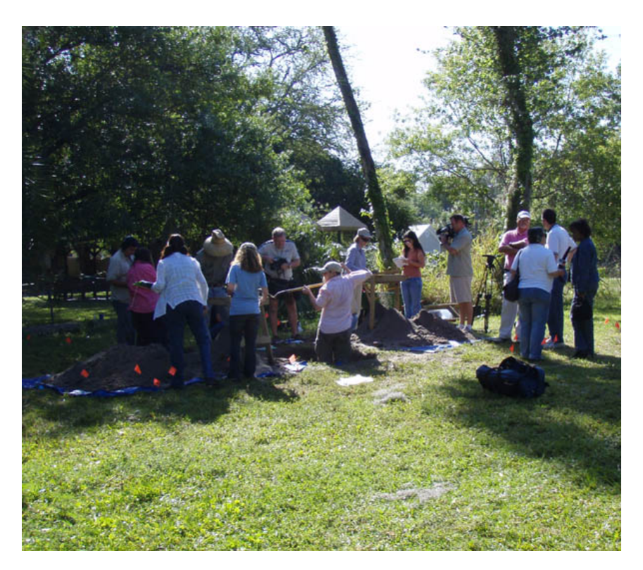
Figure 3. Media interest in the excavations.

From the start, Looking for Angola has had a firm commitment to civic engagement and public education. Dozens of public lectures and discussions from Tampa to Sarasota mark the endeavor as well as extensive media coverage and teachers' workshops (Figure 3). A web page