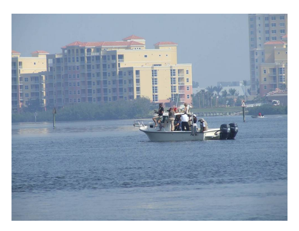
Figure 4. Underwater survey of the Manatee River.

Initial testing in some likely locales produced challenges (Baram, 2006) that required that the methodology be rethought (see Norton and Espenshade 2007). We moved to surveys, both underwater in the river and with remote sensing on land. The underwater survey (Figure 4) showed a clear river bottom, the result of a series of efficient Army Corps dredging.<sup>1</sup> One area, a mile west of the Braden River, may be promising; scuba searches are being planned for that locale.