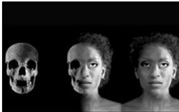
This reconstruction shows how the "Ivory Bangle Lady" may have looked.

Archaeologists have revealed the remains of what they say was a "high status" woman of African origin who lived in York during Roman times.