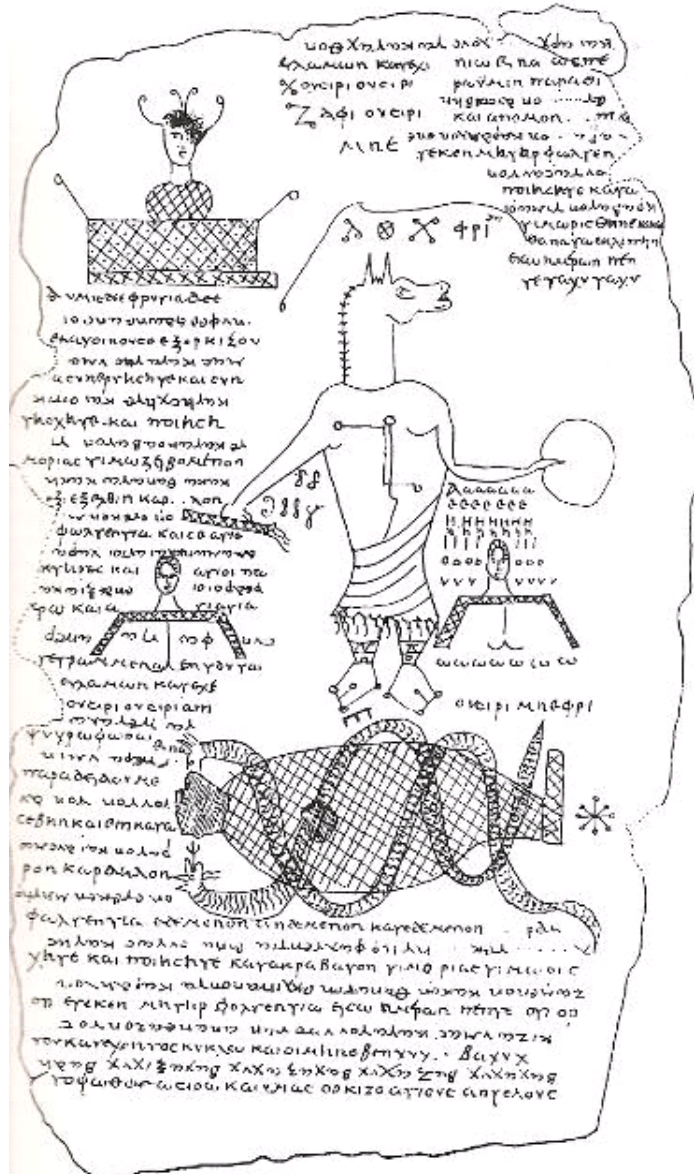
Figure 4. Late Roman defixio , Via Appia, Rome. From J. Gager Curse Tablets and Binding Spells from the Ancient World (Oxford 1992).

Fennell correlated the BaKongo cosmogram with a specifically Congo-Angolan (rather than generally ‘African’) diaspora by constructing an ethnographic analogy based on sixteenth to nineteenth century accounts of West Central African beliefs and practices. Identification of potential ‘core’ identity markers among Roman slaves cannot proceed by looking forwards from the Roman period in this way, but we can compare sideways, to the symbolic systems of peoples dominating the external slave supply at specific points in Roman history. Unfortunately, the study of ancient slavery is severely impeded by a lack of collaboration between ancient historians and archaeologists, and by the resultant failure to ‘marry words and things’ (Hall 2000: 16-17) that historical archaeologists of the modern world regard as essential to the