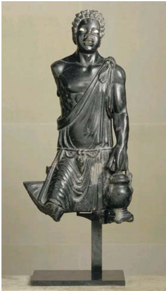
Figure 1. Black marble statuette from the baths at Aphrodisias, Turkey (late second-early third century CE). The standing figure wears an exomis , a short tunic gathered at the waist and fastened over one shoulder. In his left hand he holds a balsarium , a flask holding perfumed oil. It is likely, but not certain, that the person depicted was enslaved (Musée du Louvre, © R.M.N./H. Lewandowski).

In the Americas, somatic distance rendered slaves (and all persons of African descent) readily identifiable. In the Roman world, by contrast, there was no close correlation between somatic type and servile status. As Thompson (2003: 104) puts it, ‘the overwhelming majority of slaves in Roman society was always white.’ Difference could be marked on the body in many ways, however, and a small but significant group of texts and artefacts suggest that cicatrisation (scarification) was employed by African peoples known to Rome. For example, cicatrisation marks are clearly present on the terracotta head of a Sudanese woman from the Fayum (Snowden 1970: 22-3 and Fig. 3), but not all blacks in the Roman world were slaves, and there can be no