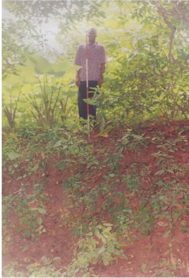
Figure 2. The outer rampart.

An iron-working site was located very close to the outer rampart in the northern part of the village. Iron slag and tuyeres litter this area. However, no furnaces were discovered. Oral information showed that iron-working was a major occupation of extinct Keesi . We were also informed that in the process of farming, the people unearthed ‘ oju awa ’ (tuyeres), ‘ omo owu ’ (hammer stone), smoking pipes, and wooden and iron objects, among others. It is disappointing that no records of these finds during farming have been kept and this amounts to a destruction of the archaeological record.