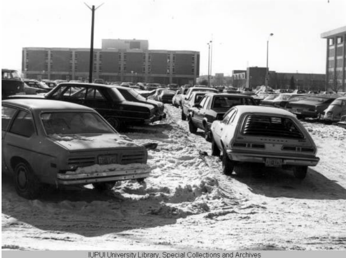
Figure 5: Like most commuter campuses, parking has been a perpetual problem at IUPUI, and much of campus displacement was intended to create more parking for students, faculty, and staff.

dormitories constructed in 2003 were named after figures from the near-Westside. At the dormitories' May 2004 dedication ceremony many descendants and community members accepted the university's invitation to commemorate these community ancestors. Encouraged by this success, an informal campus history group installed 20 historic signs on campus documenting communities that once lived on the present-day landscape.