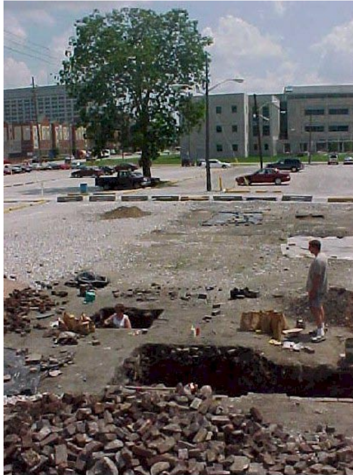
Figure 1: In 2001 IUPUI conducted its first excavation on campus when it excavated an early 20th century African-American boarding house and a neighboring meat packing operation.

one that needs to move beyond replacing one self-interested representation with another -- an engaged analysis should reveal contending interpretations with an eye toward asking how those different analyses reflect contentious political standpoints. For instance, elders who work with our archaeology project in Indianapolis' near-Westside tend to frame materialism in terms of how consumption displayed African Americans' citizenship, avoiding seeing materialism in terms of how much things cost and instead interested in how a vast range of African Americans secured a foothold in American society, even if they did it with modest material things. This invests even rather mundane things like inexpensive household goods with significance that might pass unnoticed in many conventional archaeological analyses that tend to revolve around price and distance from an ambiguous social and material norm. This breaks from the commonplace archaeological position of assessing consumption primarily in oppositional terms, such as affluence or its absence, or resistance to dominant social and stylistic norms as opposed to being subsumed within those norms (whether by force or will). Instead, the questions elders ask of many goods are about resourcefulness, forethought, and ambition, stressing agency along the color line and staking a claim to the central features of American identity even as they temper