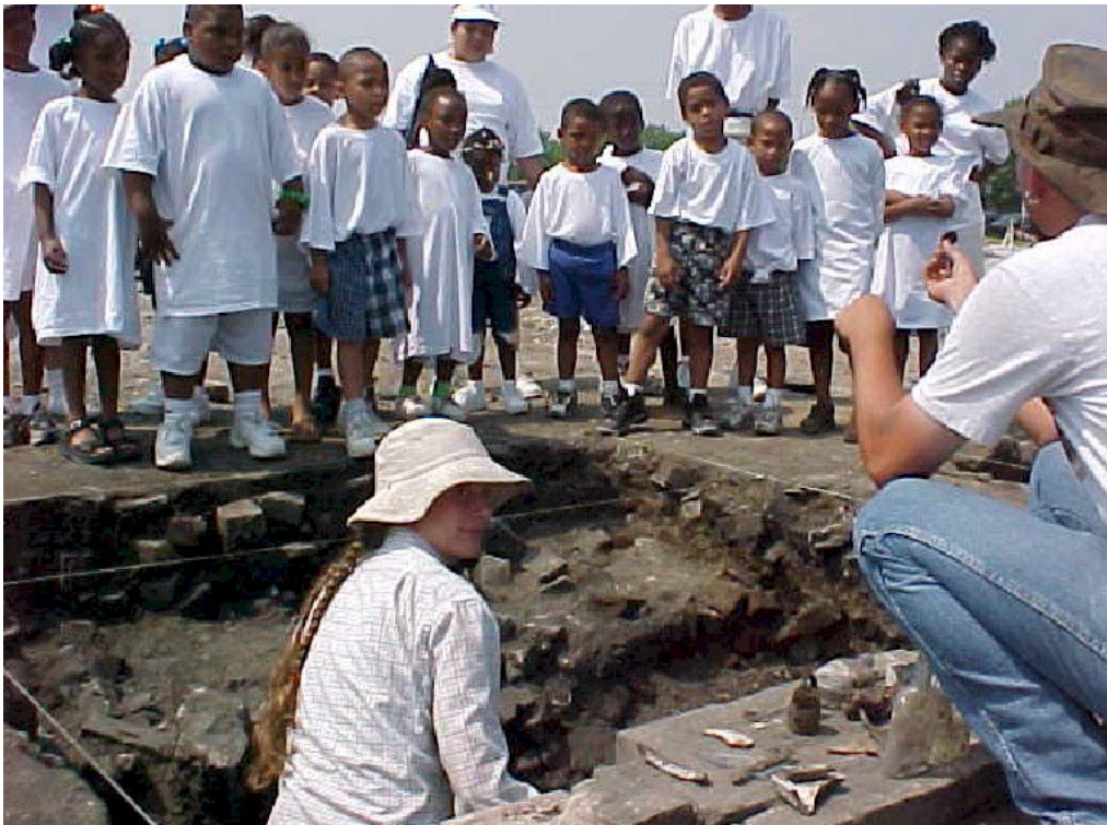
Figure 2: A group of Indianapolis students peer into a cellar excavation during the 1991 field season (Photo by Paul Mullins).

its celebration of affluence and reject its assumption that such values are White exclusive. This risks its own romanticization of agency by gravitating toward around conventional middle-class values and minimizing the concrete, racially rationalized poverty community endured. However, some former near-Westside residents are circumspect about placing racism at the heart of historical analysis because they fear that the subsequent narrative will be about how racism shaped Black lives and not about African Americans' agency in the face of such structural boundaries.