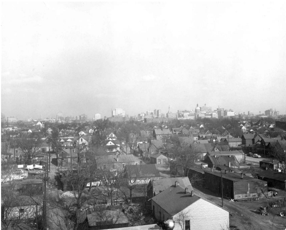
Figure 3: In about 1940, this photography was taken of the neighborhood where the IUPUI campus now sits. Today, every home in the picture has been removed.

always embraced car culture, complaints about parking and automobility are perhaps predictable, but they reveal how the campus community does not see itself as privileged at all and separates parking spaces from the processes that displaced the community. For example, in the very first issue of the IUPUI newspaper in April 1970, one student already was irate about the number of “unimproved, unlit parking spaces” ( Onomatopoeia 1970: 4). He revealed that the parking lots, campus, and his very car were mechanisms that were meant to distance him from a neighborhood with which he did not wish to engage at all. He complained that IUPUI had settled in “one of the highest crime-rate districts,” so it “should accept the responsibility of the safety of its students. . . . One murder, rape or molesting will make the beautiful campus a cancerous breeding ground for fear and panic.” Spurred by such sentiments, the University gradually purchased single lots over more than 30 years, razing structures as the lots were sold and extending parking lots into the newly acquired spaces.