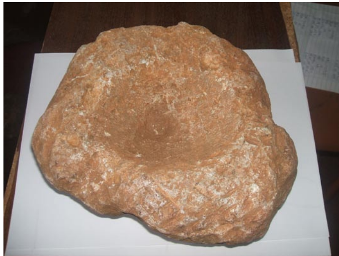
Figure 4. Example of grindstones uncovered in 2008 survey.

Okodo, several centers of past human activities were observed. At Igbo ilowe, reconnaissance in an area covering about 2.5 square kilometers yielded the remains of additional steatite sculptures. Among the other more prominent archaeological finds in this survey are: a fishing weight; a prehistoric-period worked stone implement, which would have been perceived in historic period cultures as a “thunderbolt” ( edun ara ); and several grinding stones, some of which were made of