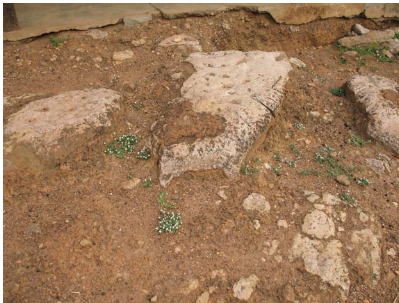
Figure 6. Outcroppings of steatite in ground surface of 2008 survey area.

reported to the team that the implements of Opon ayo , a game common among the Yoruba people, were often made of steatite and used by current occupants of the area. Apart from the stone sculptures, five refuse mounds were identified; two of these had been excavated by a previous archaeologist, Onabajó. The whole landscape was littered with pottery sherds of diverse sizes and decorations. Pieces of terra cotta were also collected in the survey.