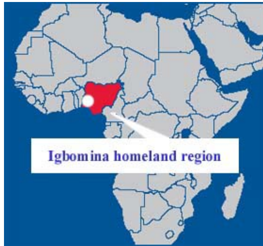
Figure 1. Study area location within modern Kwara State, Nigeria.