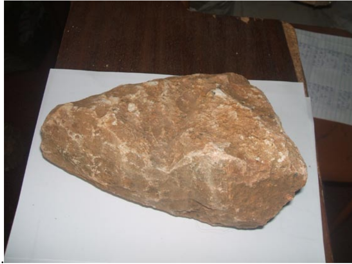
Figure 5. Prehistoric worked lithic artifact uncovered in 2008 survey.

reported to the team that the implements of Opon ayo , a game common among the Yoruba people, were often made of steatite and used by current occupants of the area. Apart from the stone sculptures, five refuse mounds were identified; two of these had been excavated by a previous archaeologist, Onabajó. The whole landscape was littered with pottery sherds of diverse sizes and decorations. Pieces of terra cotta were also collected in the survey.