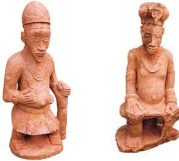
Figure 3. Examples of steatite statues uncovered in landscape surrounding Esie. Images by International Council of Museums, Redlist of endangered cultural heritage artifacts, http://icom.museum/redlist/

However, in addition to the remarkable cultural heritage represented by those figurines uncovered at Esie and other sites, features of the natural and cultural heritage of the homeland region of the Igbomina people also include: