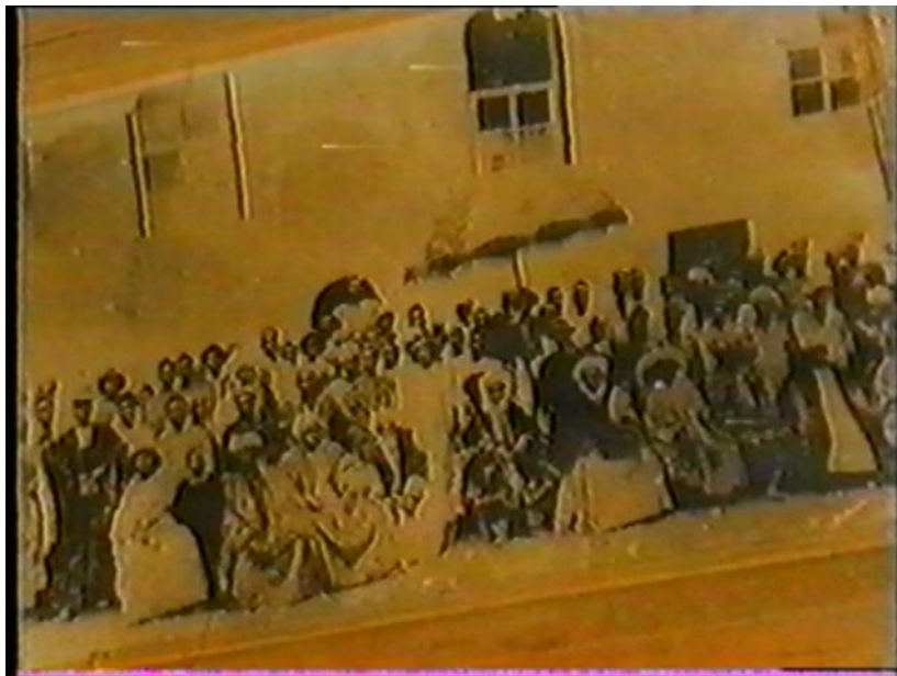
The Umbrella at the installation of Chief Seriki Abbas in Badagry during the 17th Century.