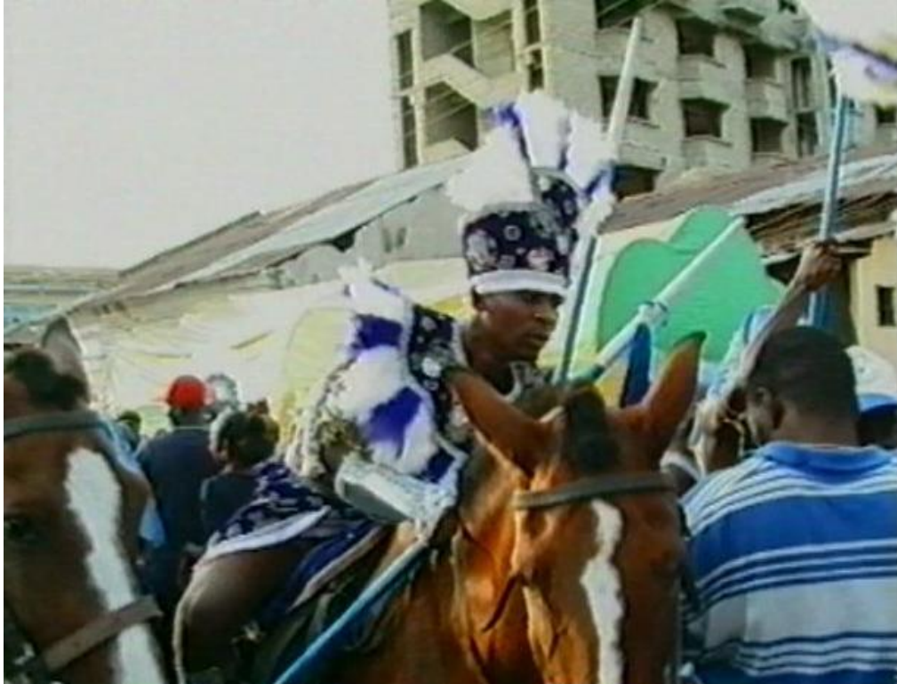
A male participant on horseback during a Fanti carnival.