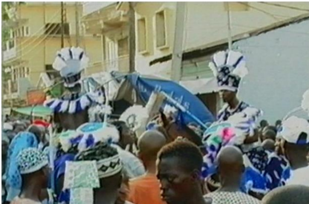
A cross-section of festival participants.