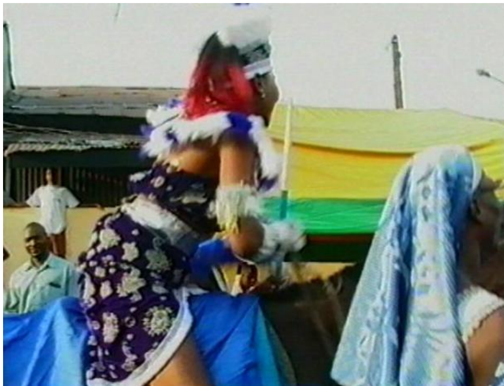
A female participant on a horse during a Fanti carnival.