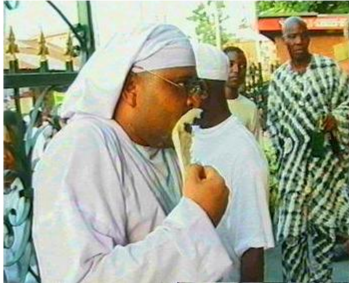
The “Holiness” prayer band “prophet” motif.