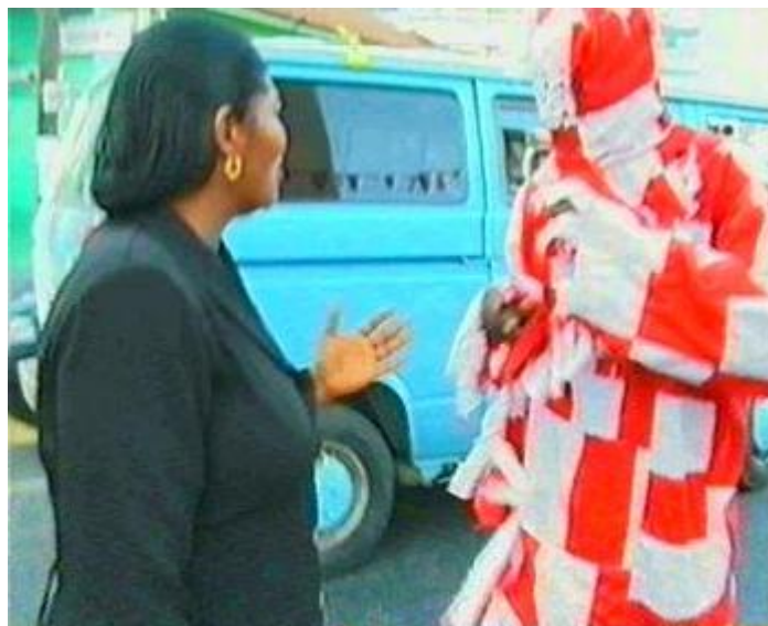
The researcher with a member of the Lafiaji Fanti Group.