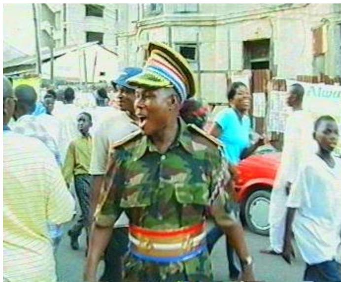
The “No more soldier – welcome Democracy” motif.