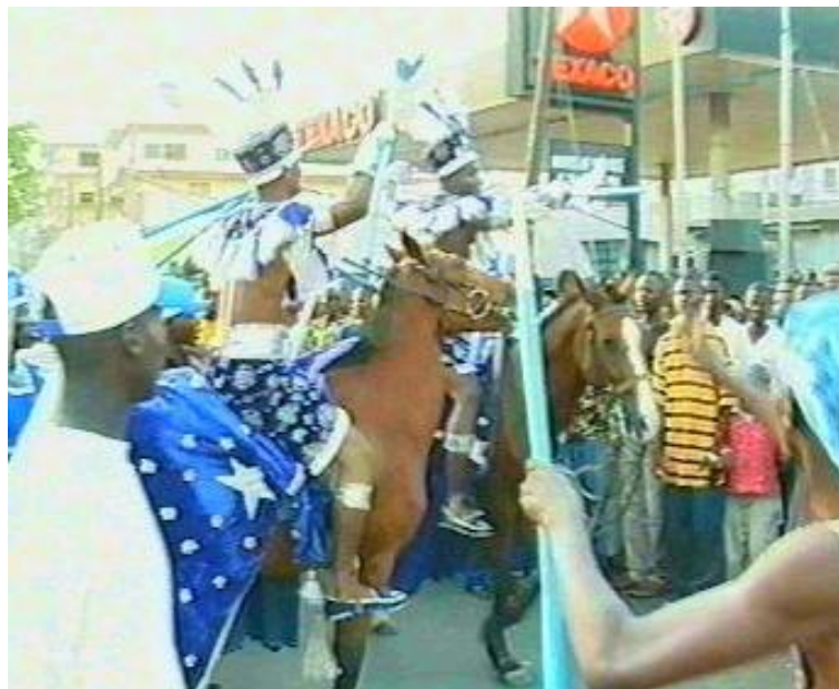
Another view of male participants on horseback during the carnival.