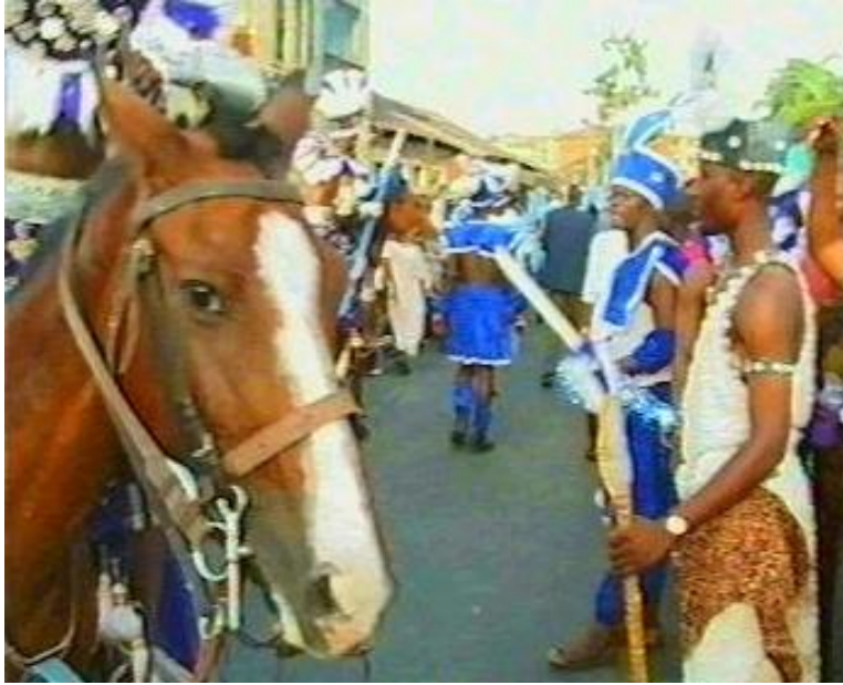
Participants and their horses at a carnival.