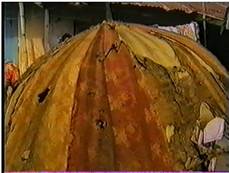
The umbrella as recorded in the year 2001.