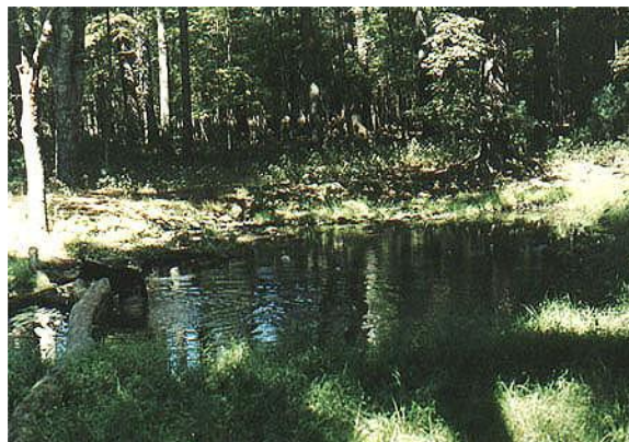
Figure 3: Example of a limestone sinkhole.

At the plantation, a fountain was cared for as a part of the landscaping. It was at that fountain the Ruffin first heard of a belief amongst the slaves regarding water spirits. Each fountain of any considerable size was believed to be inhabited by what they called a “cymbee.” This was Ruffin’s best guess at a spelling and he mentions that he doubts if the word was ever written before. Each fountain had its own cymbee, with each “having a different size, appearance, and set of habits” (Matthew 1992: 166).