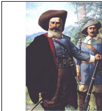
Image of the bandeirante Domingos Jorge Velho, oil painting by Benedito Calixto, 19th century (left), used to exalt the figure of the Paulista Bandeirante, especially that of the man responsible for the military overtaking of the Palmares Quilombo.

governor of Pernambuco decided to summon Domingos Jorge Velho, a bandeirante , in 1687, to command the expeditions against Palmares. After seven years of attempts, Domingos Jorge Velho, leading an army of colonists, Indians and mamelucos (mestizos of Indian and European descent), finally destroyed the settlement. Zumbi was not captured until November 21, 1695.