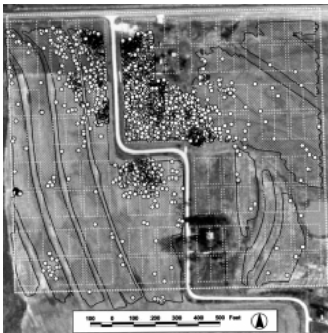
Figure 4. Map showing the distribution of all historic artifacts found in the New Philadelphia pedestrian survey.

which covered areas formerly under cultivation. This process generally provided greater than 75 per cent ground visibility over the majority of the plowed field. Subsequent precipitation and weathering improved artifact visibility. The plowing allowed for about 26.5 acres (10.6 ha), or approximately 63 per cent of the 42-acre (16.8 ha) site, to be exposed (Beasley and Gwaltney 2003).