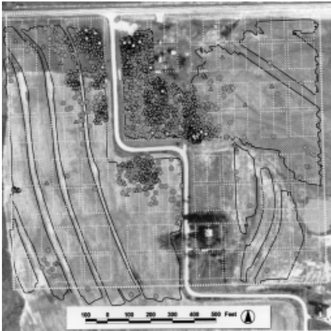
Figure 5. A distribution of domestic artifacts. The squares are doll parts, the hexagons are buttons, the triangles are curved glass, and the circles are ceramics.

commercial enterprises (Figure 4). All of the historic period household sites appear to cluster near the center of town on about 25 per cent