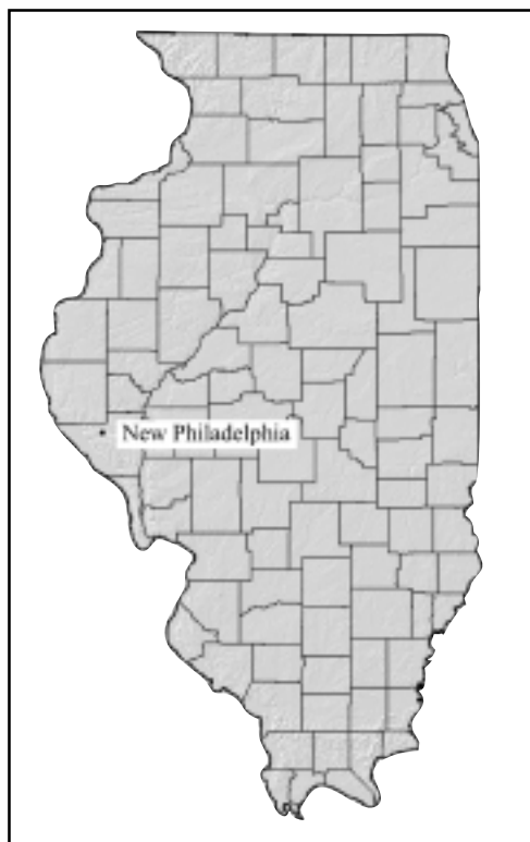
Figure 1. Location of New Philadelphia

In 1819 the first manumission colony in Edwardsville, Illinois stood as one of the most prominent settlements of the Organized Negro Communities Movement . The Edwardsville Settlement operated as a paternalistic endeavor by Edward Cole, who freed