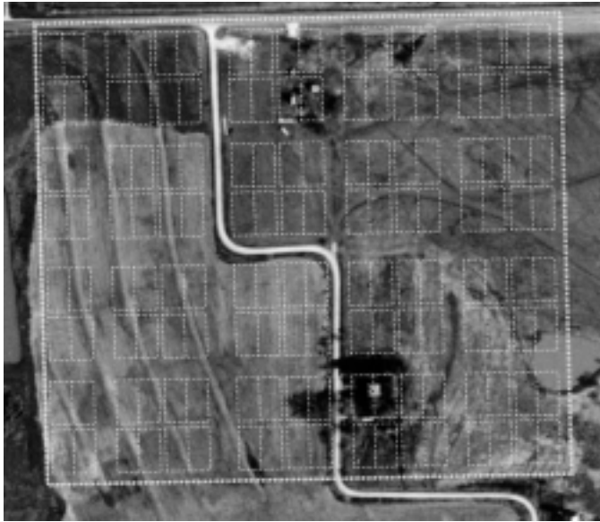
Figure 2. 1836 plat of New Philadelphia overlaid on a recent aerial photograph of the site.

thirteen slaves and purchased land so that they could develop farms. Other paternalistic settlements developed following Cole's lead, although many of these settlements failed, in-