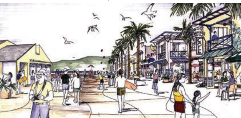
Figures 3 a & b: The concept for the Front Street pedestrian promenade from the Specific Plan, and a photo after completion.

safety. Differently from what the plan predicted, Landing Passage’s success was not due to a seamless movement of people from the parking lot, but as a place to wonder into and access retail and eateries.