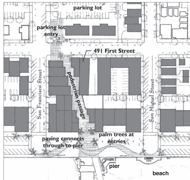
Figures 4 a & b: The concept for Landing Passage suggested a more linear connection to the beach than what was built.

The park is considered a huge success by the community as it constantly in used by families, both local and visitors, non-profits, and school children during field trips. The popular Bob Jones bike trail, which eventually will connect to the city of San Luis Obispo, ends at the Avila Beach park.