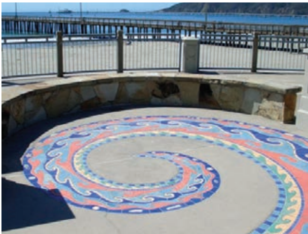
Figure 6: The Circle of Life mosaic by local artists Tres Feldman and Ginny Vreeland, located at the Front Street Promenade (see lower right corner of Figure 4b).