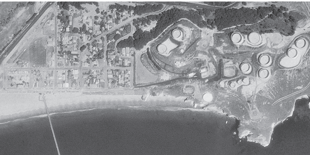
Figure 2: Avila Beach in 1994, before the clean up and reconstruction. Note the tank farm up the hills to the right.

with benches and undulating strips of red colored and beveled asphalt define pedestrian spaces from roadway for times when the street needs to be open to vehicles (Figure 3b). Front Street is the Specific Plan’s most successful and popular feature.