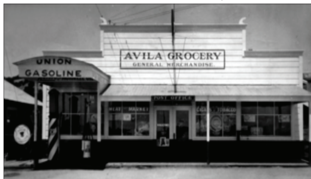
Figure 1: The Avila Grocery store in 1925, an example of the old town's architectural character. The building was removed for the clean-up and rebuilt on Front Street.

The design for Front Street incorporates attractive and innovative streetscaping features, all ADA compliant. Planters