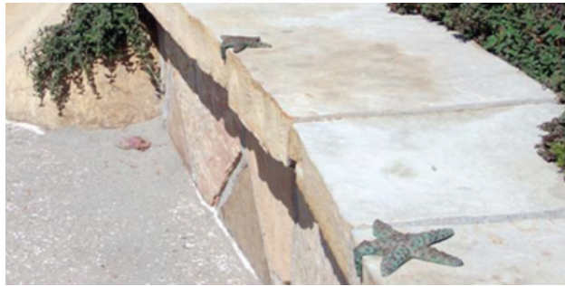
Figure 7: Bronze sea-stars prevent skaters damaging planters and benches