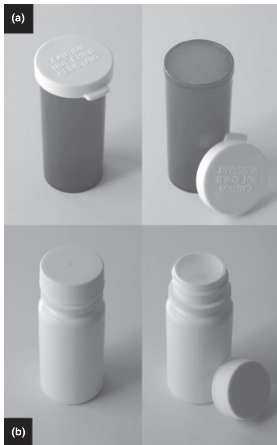
Figure 2 Screening Packages (2A-Snap Closure and 2B Continuous Thread Closure).

1-min-period testing the original CR package, otherwise the person is eliminated from testing and replaced with another participant. See Fig. 1 for a schematic of the current adult test, as dictated by the protocol.