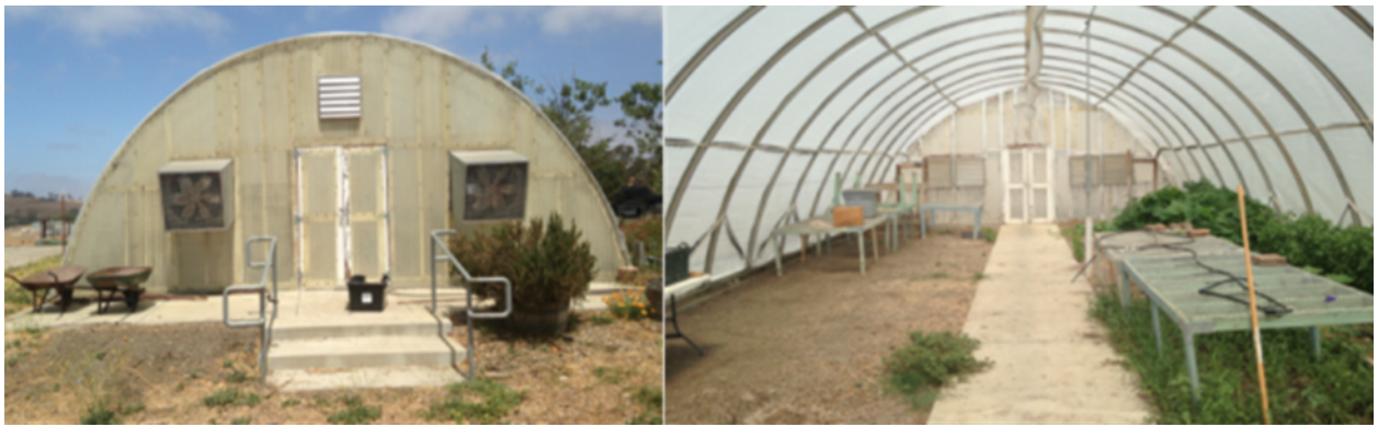
Figure 1. Greenhouse at the SEF. New location for the Poly Ponics – Living Lab.

The construction of the aquaponic facility included finding and moving to a bigger location. A greenhouse connected to the student experimental farm (SEF) was located, and we were granted permission to use the space. As seen in the following figures the greenhouse was transformed into a living lab for the purposes of working with plants and fish as well as developing a community and a place to learn.