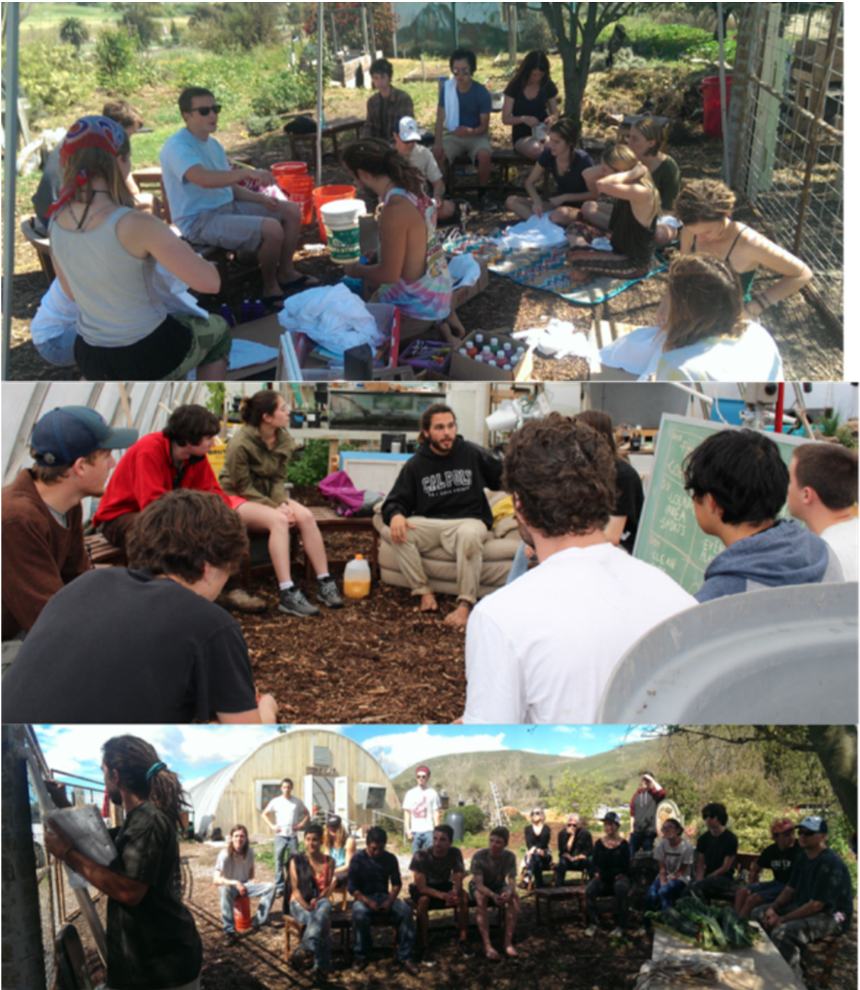
Figure 6. Activities include work days and play days. Tye die day (top), polyponics living lab day (middle), one of many weekly work days (bottom).

Active learning continues at the SEF with the Polyponics living lab at the center of the activity. Without the Baker / Koob funding this would not have been possible. Workdays are on Sundays, every week. We hope to see you out there.