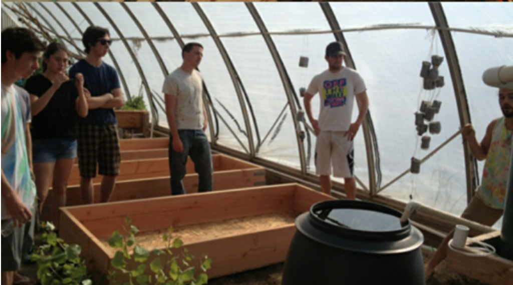
Figure 4. Construction of grow beds 2, 3 and 4.