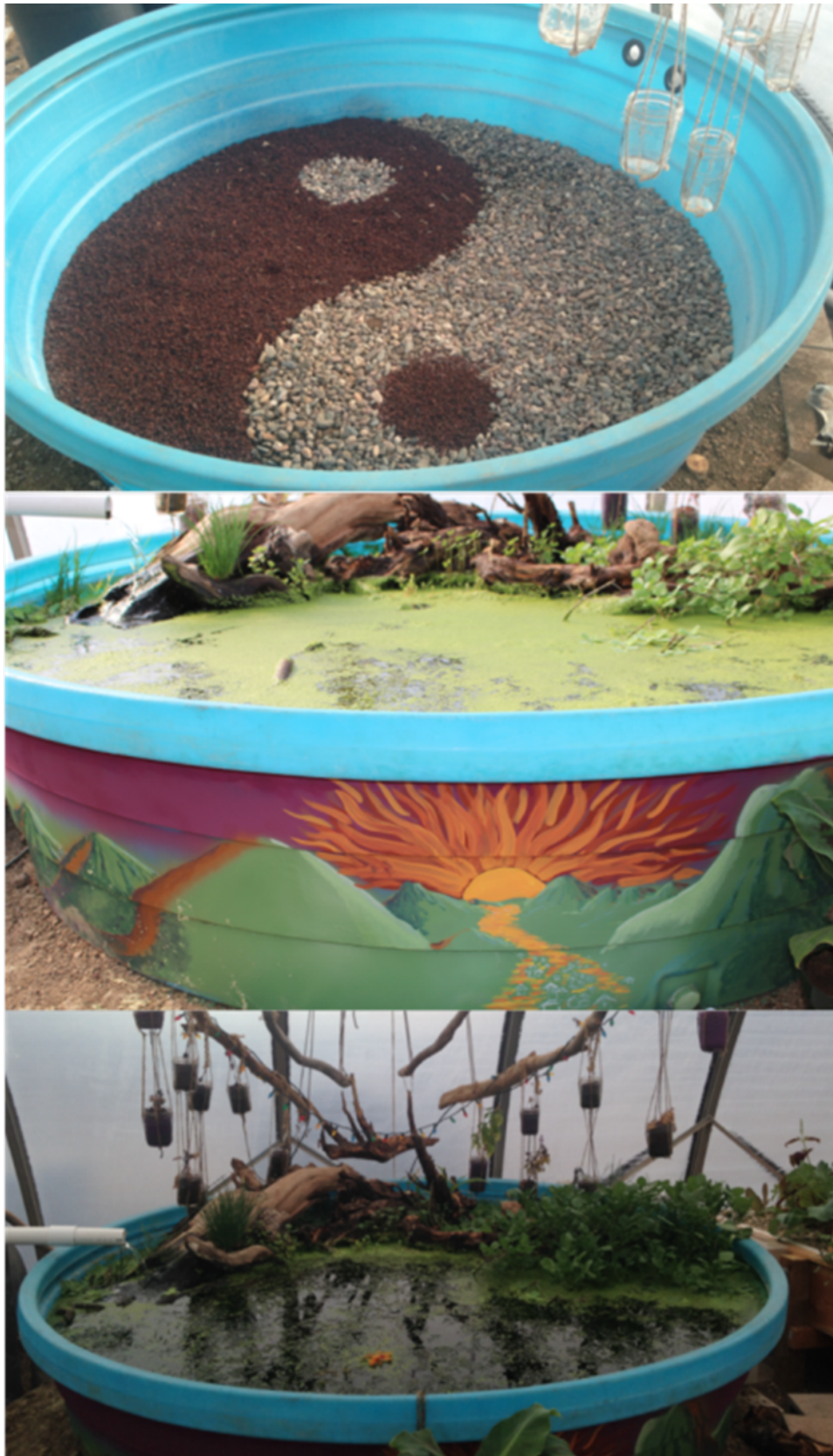
Figure 5. Construction and final design of biodiversity pond.

A community has been developed at the SEF to promote unity, and embrace differences among community members. This “living lab” also allows people to express themselves as they see fit. This has promoted independence and leadership and has helped to develop communication between students, faculty and administration.