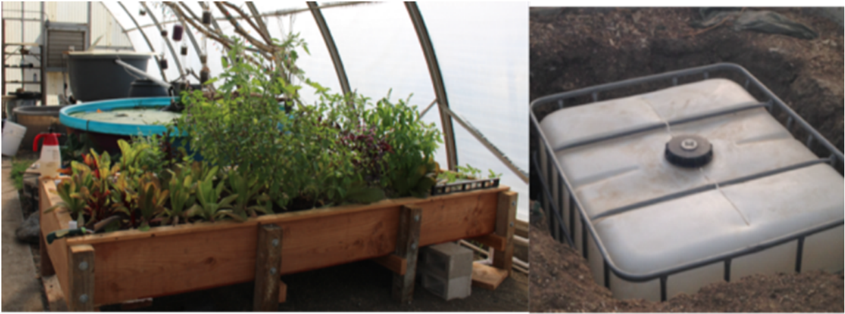
Figure 3. Actual polyponics configuration. (from left to right) Fish tank, solids settling tank, biodiversity pond, grow bed number 1 and sump reservoir.