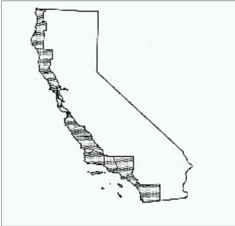
Figure 1. Counties Within the California Coastal Zone