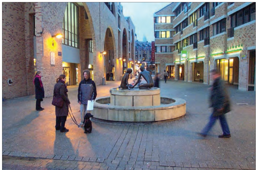
Figure 6: The new university town of Louvain-la-Neuve, Belgium, central axis, Michel Woitrin and Raymond Lemaire, urban designers, 1970.

In an urban context the core of Battery Park City (1979-2010), the World Finance Center, is international in character and a precedent for the core of the Docklands in London and the Abandoibarra precinct of Bilbao in Spain. They were, after