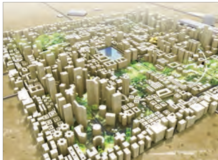
Figure 10: A generic design for the arid climate Islamic Arabic City. (image courtesy of the Office for Metropolitan Architecture)

The designing process is one of conjecturing and testing. Designers argue about ends and means among themselves, their sponsors, and a variety of interest groups each striving to be heard. Designers' power comes from their knowledge about how cities function in a multi-dimensional manner for diverse populations. Good evidence for designers' claims comes from