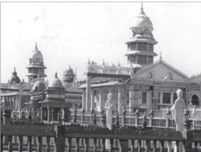
Figure 5: The Neo-Vernacular Shri Ramiaiah Institute campus, Bengaluru, 1990s.

The Neo-traditionalists have been more successful by relying on the principles rather than simply the forms of traditional architectures in their new designs. They have, however, also fallen into the trap of copying past forms and of assuming past ways of life would endure. The design products are valid only to the extent that their assumptions are accurate. The question is: On what traditions does one draw?