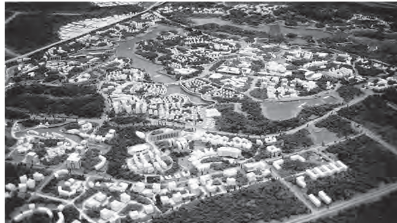
Figure 4: The model of Shongshang Lake, Guangdong, China (2004).

“ . . . not because they are desirable, healthy, reasonable . . . but because they are theatrical . . . unreasonable and generally harmful and . . . part of the money making activity of the metropolis.” (Hegemann cited in Oeschlin 1993, 287)