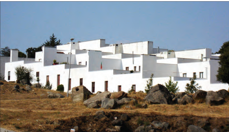
Figure 9: Alvaro Siza's critical regionalism: Quinta da Malagueira in Evora, Portugal.

Landscape Urbanism represents an approach to urban design that promises much but has yet to present a coherent unified model of its intentions to the professional world. Starting with the plea of Ian McHarg to "design with nature" (McHarg, 1969). Landscape Urbanists take the position that the natural ecology of an area should provide the framework, the basic armature, for an urban design (Steiner, 2011; Kuitert, 2013). Applying this concept to green-field sites may be conceptually, if not politically and economically straight forward, but applying it to existing cities is less so. Little has been said by Landscape Urbanists about how to provide for the ways of life of diverse sets of people within diverse cultural environments.