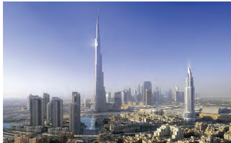
Figures 2a & b: International rationalism at Zhandong, Zhengzhou by architect Kisho Kurokawa and Associates (left). The Dubai skylight turned into a brand (right). (left: courtesy Kurokawa Associates; right: http://www.wallm.com )

quality of their city's public realm in order to: 1) provide residents and visitors with a pleasant environment in which to carry out day-to-day activities, and 2) create a positive image, or brand, in the eyes of the world and thus attract capital investments in order to compete effectively with other cities for the creative class of people. 4 In doing so they have to choose between competing design paradigms that reflect competing ideas of what makes a good place (Figure 2). What then are the brands available for them to purchase?