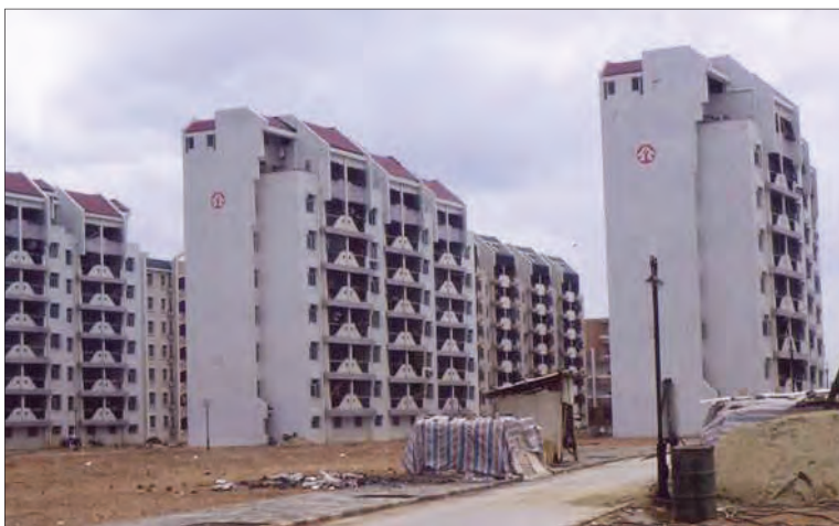
Figure 3: The generic mass housing design in China and an example in Shenzhen (2002).

and powerful clients alike. The latter has been more concerned with reproducing what works well in new forms.