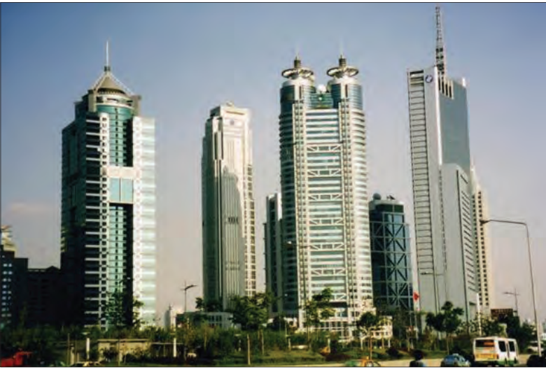
Figures 1a & b: Lujiazui, Pudong, Shanghai (above) and office tower at Gujarat International Finance Tech City (GIFT), Ahmedabad (right).