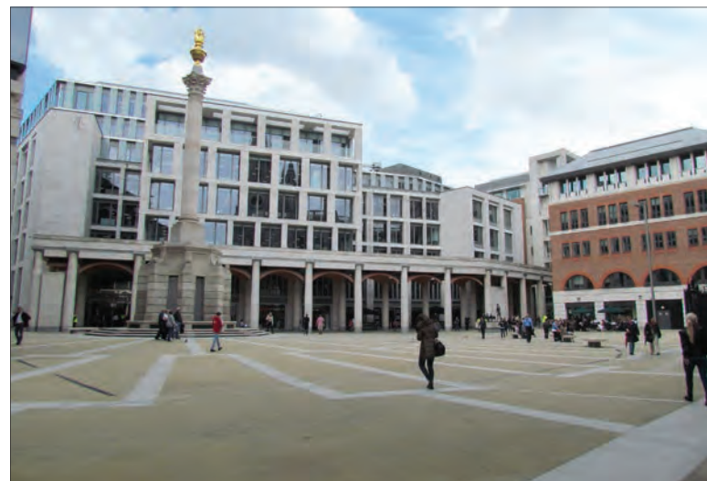
Figure 8: Neo-traditionalism at Paternoster Square, London.

Recent efforts to develop generic models of sustainable urban environments include explorations for the generic form of cities given their climate and basic cultural ethos and the somewhat fragmented ideas of the Landscape Urbanists. These explorations are exemplified by the similar designs for cities in the United Arab Emirates by the Office for Metropolitan architecture (OMA) under the leadership of Rem Koolhaas and the Foster Partnership (Figure 10). The former's design for Masadar City and the latter's design for Ras El Khaimah have many of the same urban design characteristics. That is not surprising as they are responding to essentially the same environmental conditions.