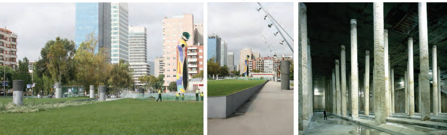
Figure 4: Barcelona's Joan Miró Garden: a square with a high quality public space design, integrating a large pluvial water deposit underground.

Focusing on innovative solutions, the contemporary design of new relationships with water includes a significant exploration and development of floating structures. Being an old concept and practice, floating structures gain a new dynamic through both their resilient capacity of floating and their high experimental potential.<sup>4</sup> Hence, this permits a