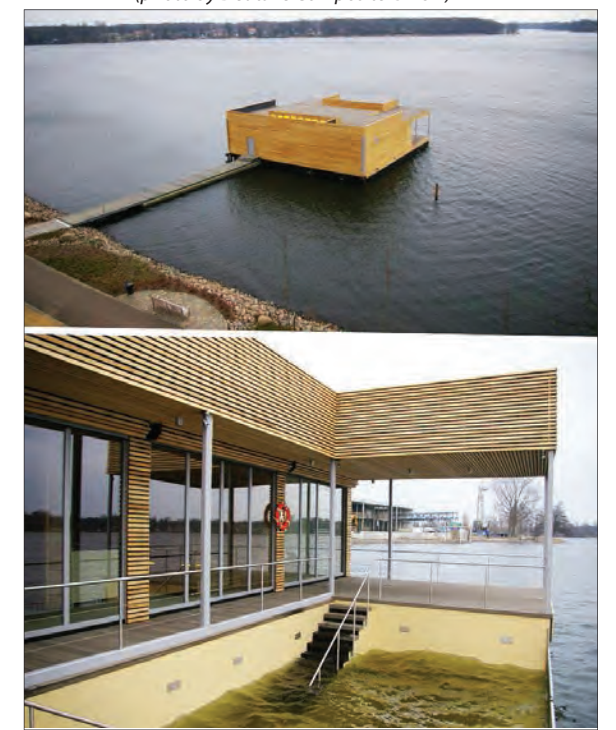
Figure 7 a & b: Rexwal's floating SPA, Germany.

greater and more efficient proximity to water that otherwise would not be viable for traditional constructions. The advance of technology has mainly contributed to determining the type of floating structure (both in concept and material), structural configuration, and light construction methods. The last decade witnessed a large expansion of these type of constructions, mainly through: (i) construction of small buildings with small scale floating structures; and (ii) exploration of floating mega structures through learning lessons from existing constructions such as sea oil platforms, with the purpose of exploring the design of futuristic utopias.