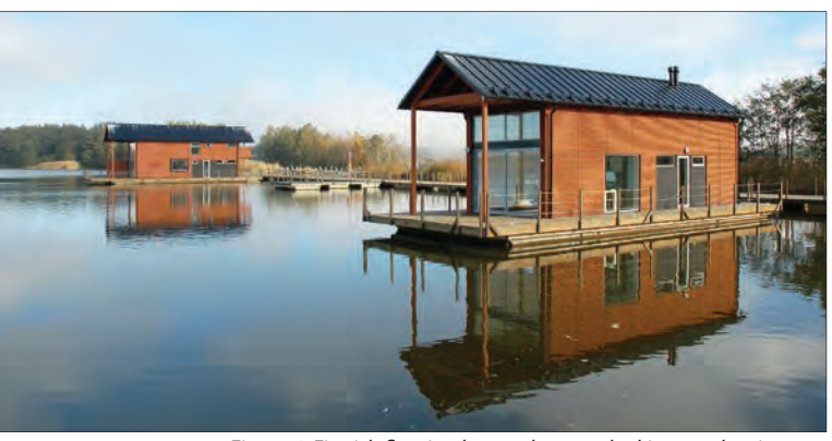
Figure 6: Finnish floating houses have an locking mechanism under their decks.

Figure 7 a & b: Rexwal's floating SPA, Germany.