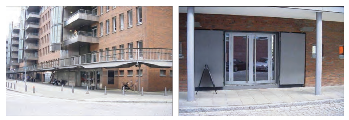
Figures 1a & b: Flood resilient urban design at Hamburg's HaffenCity a solution for flood resilient urban design area: the upper level circulation network and the protection systems at ground level.

(3) unmistakable basic conditions to explore creativity, which enables broader and "out of the box" thinking.